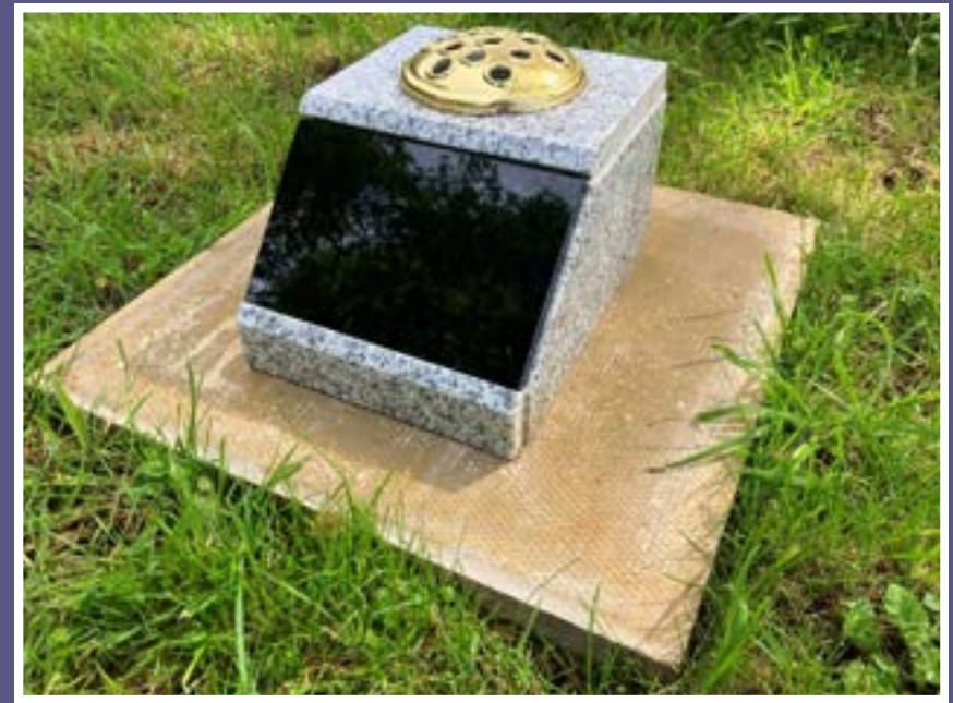
Baby Vase Block

Baby Vase Blocks are individual memorials, available for those who prefer to have their own private plot. With a backdrop of the conservation area, these high-quality granite stones provide a space just for your child. Ashes can be interred in the ground beneath if required. The memorial plaque is formed from polished black granite, featuring gold lettering, with artwork and motifs also an option. A gold-coloured flower vase is provided for each memorial, so there is always somewhere to leave floral tributes.