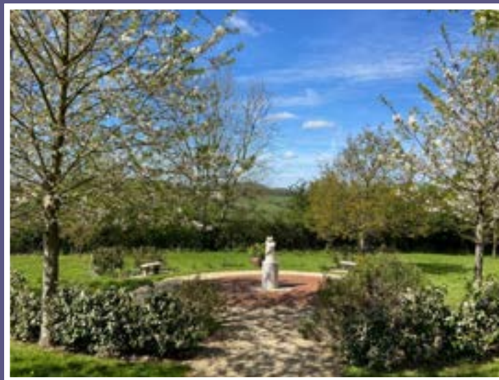
The Sands Garden

If you would like further information regarding burial, cremation, or memorials we are happy to help. Please contact the staff of Bereavement Services at Haycombe Cemetery.