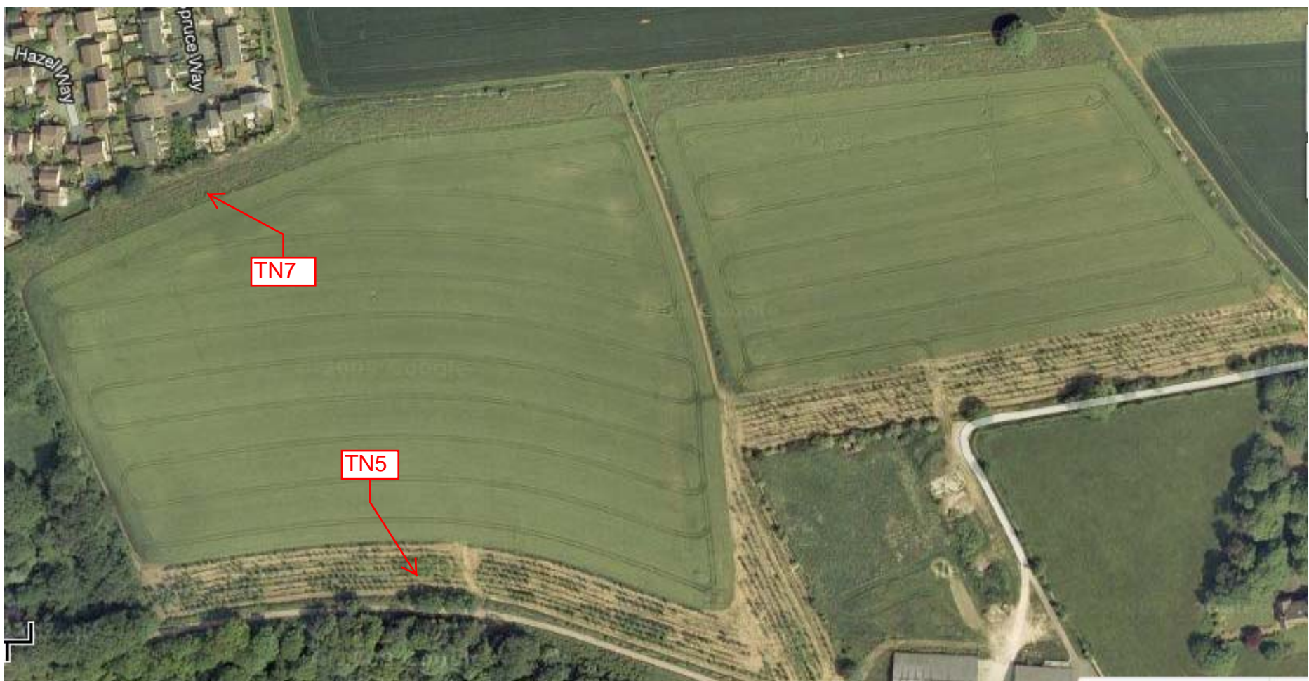
Bath & North East Somerset. Core Strategy. Bath. Odd Down/Sulis Manor. Target Note Location Plan 2. June 2013