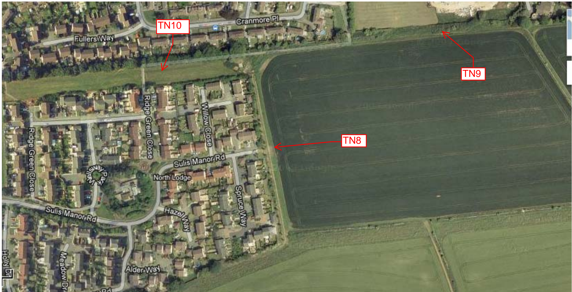
Bath & North East Somerset. Core Strategy Bath. Odd Down/Sulis Manor. Target Note Location Plan 3. June 2013