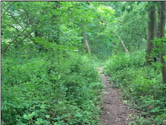
Fig. 3: Alternative Route