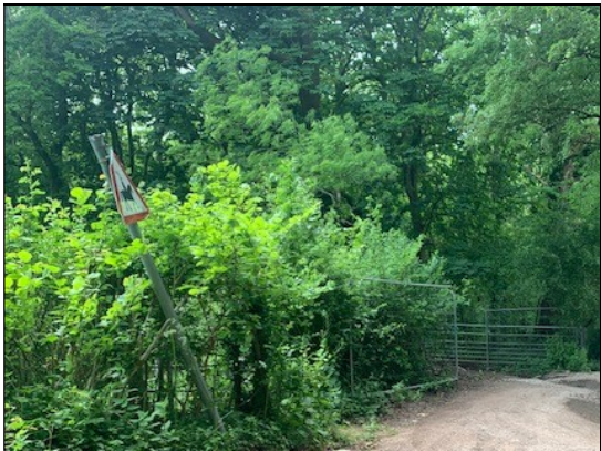
Fig. 1: Point A looking south

The Authority has investigated whether a DMMO should be made to record either the Application Route or the Alternative Route on the Definitive Map and Statement.