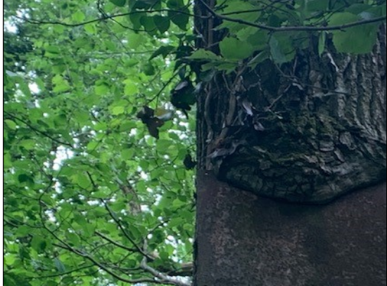
Fig. 2: Sign near point B