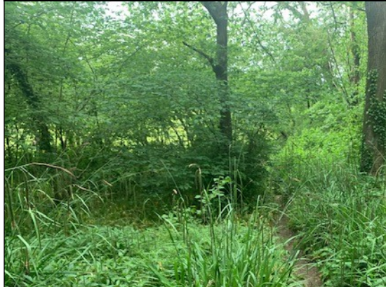
Fig. 4: Looking south towards point D