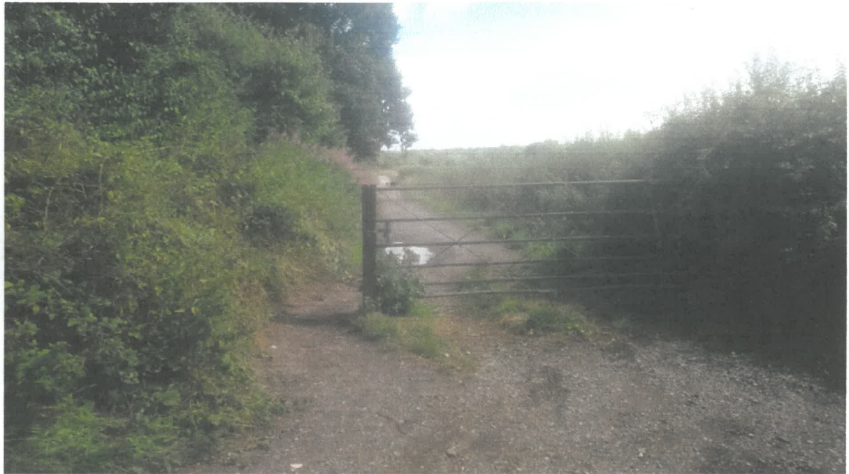
Gate at the south east end of the track