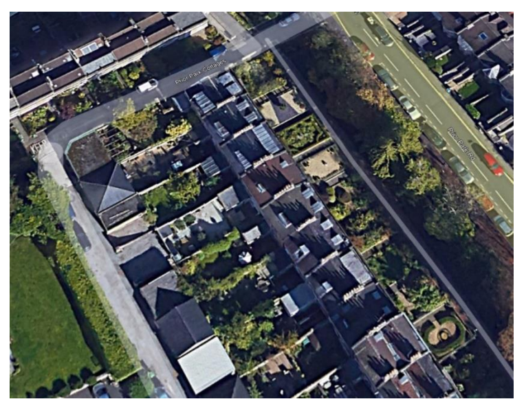
2021 (Google Map view of Nos 1-9)

These images of Prior Park Buildings dating from 1845 to the present day suggest that, originally, there were no more than one small upstanding dormer windows per property, at least since the 1840's until the 1920's.