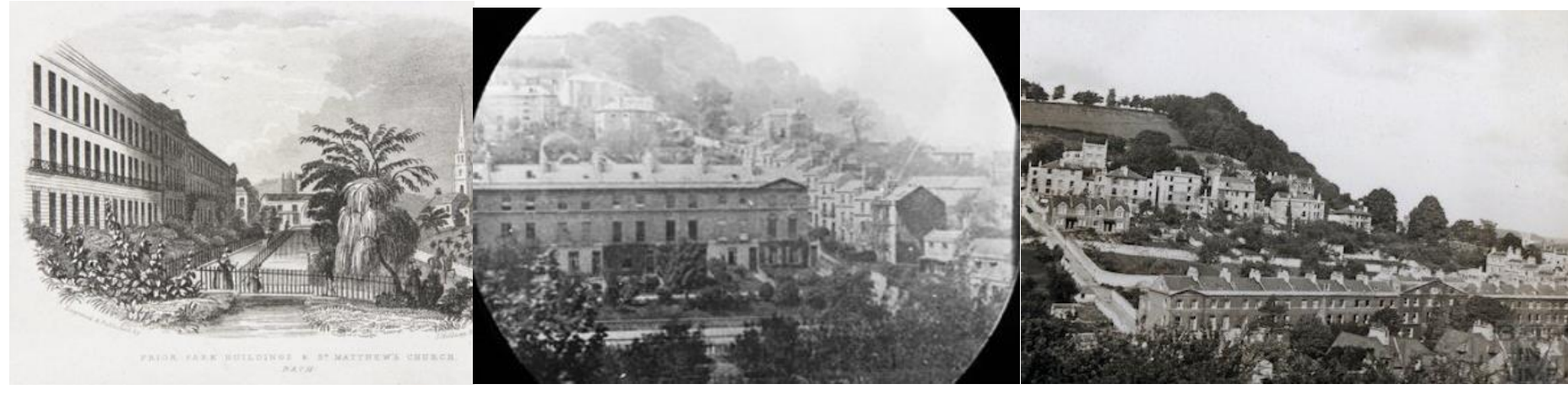
1845 (Bath In Time) 1880 (Bath In Time) 1920's (Bath In Time)