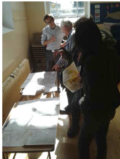
Photo from the Westfield consultation event