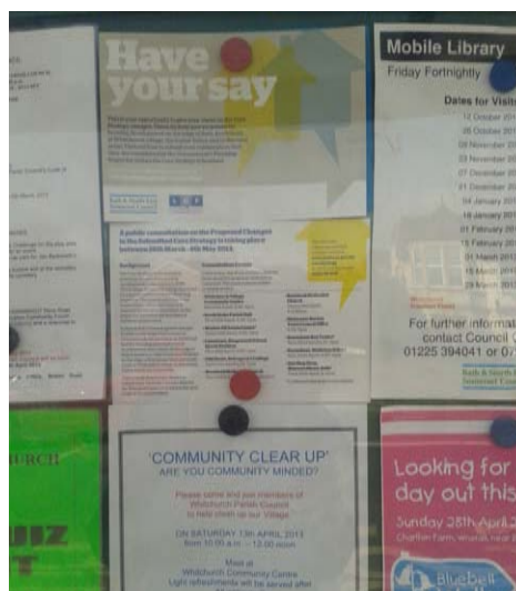
Photo: Information Postcard on a Notice Board in Whitchurch