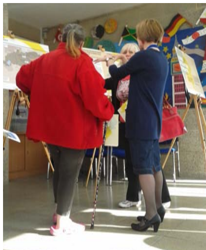
Photo from the Odd Down consultation event