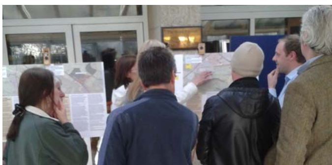
Photo from the Odd Down consultation information event