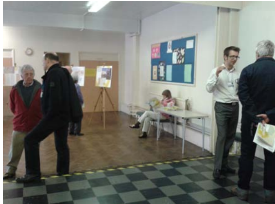
Photo from the first Keynsham consultation event