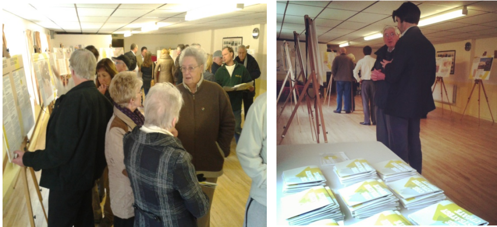
Photos from Whitchurch village consultation event

The first consultation drop-in event at Whitchurch village 4.30 – 7pm on 8th April saw a turnout of around 90 people, mostly local residents together with some from other parts of the district.