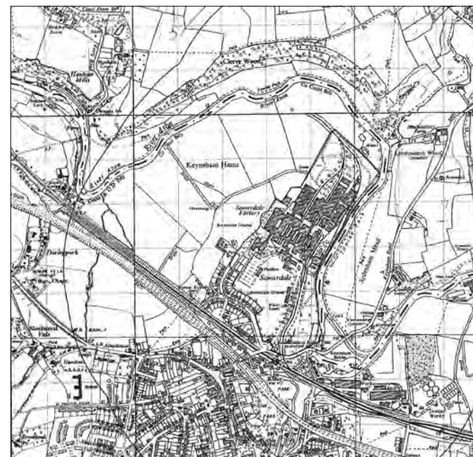
1965 PLAN - CONTINUED GROWTH OF FACTORY AND SUBDIVISION OF FIELDS FOR GRAZING