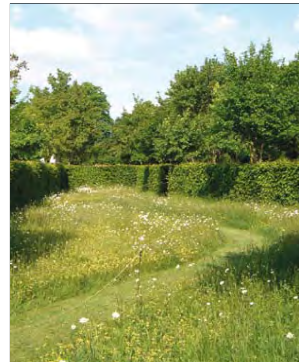
WILDFLOWER MEADOWS PROVIDING COLOUR TO THE LANDSCAPE