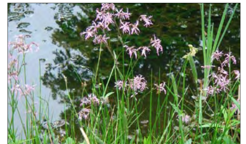
THE RIVER EDGE WILL BECOME AN ENHANCED HABITAT CORRIDOR RICH IN BIODIVERSITY