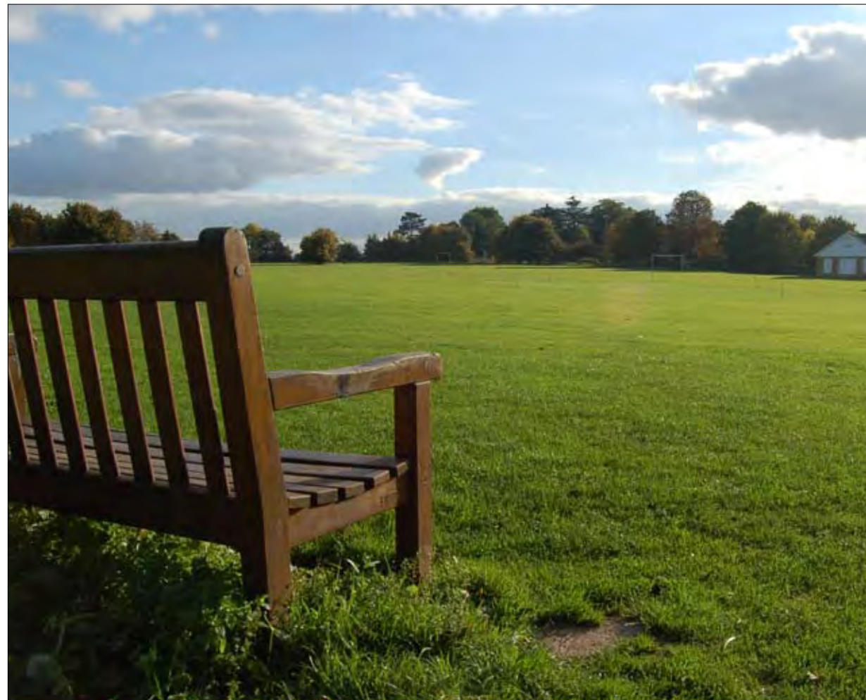
THE RECREATION GROUND WILL MAINTAIN THE CURRENT LEVEL OF PITCH PROVISION IN THE HAMS WITHIN AN IMPROVED SETTING THAT WILL ENJOY AN ENHANCED PATTERN OF DRAINAGE