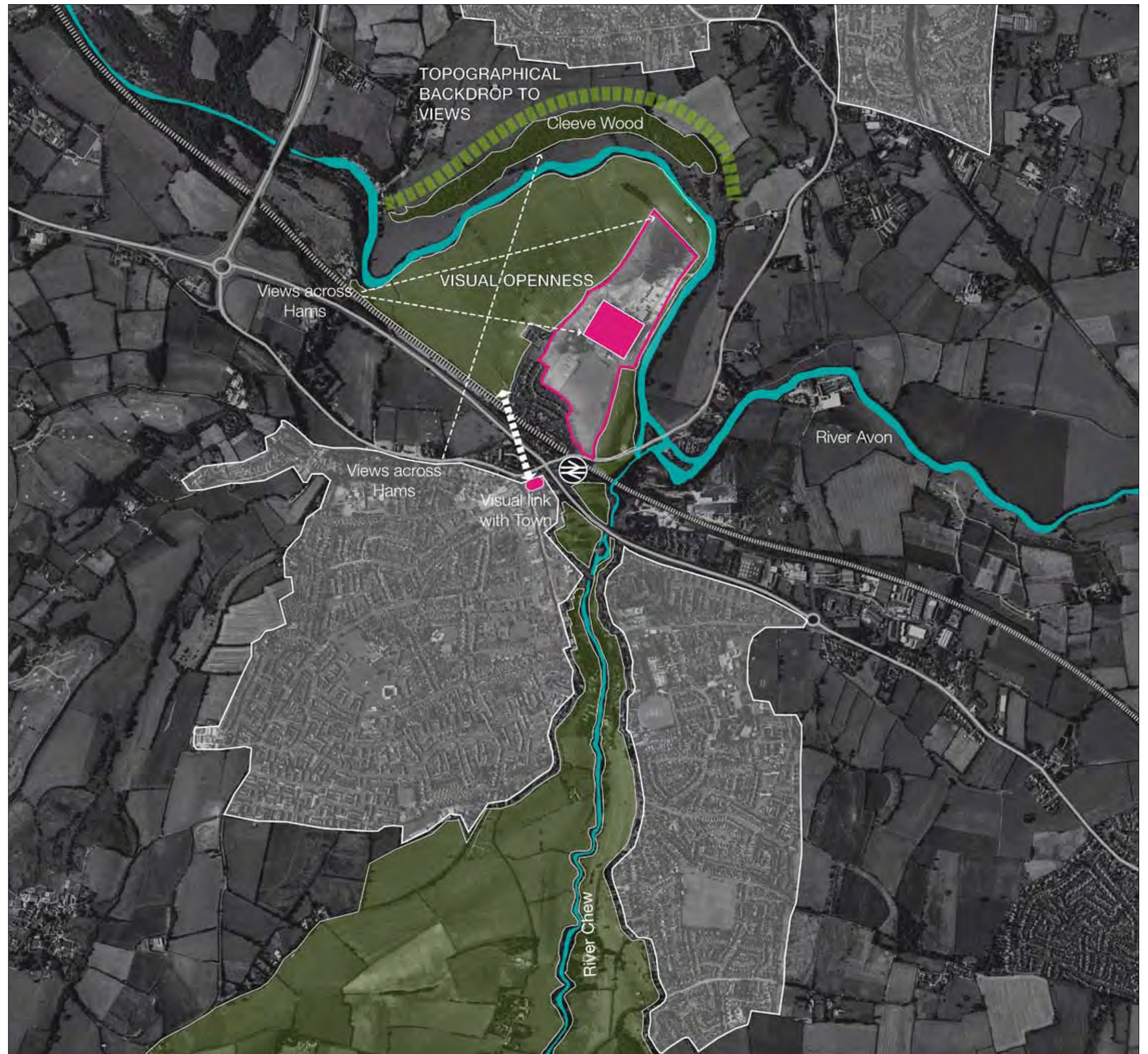
DEVELOPMENT ON HIGHER GROUND OVERLOOKS A STRONG NATURAL LANDSCAPE DEFINED BY FLUVIAL SYSTEMS. THE HAMS MAINTAINS A SENSE OF OPENNESS WHICH AFFORDS VIEWS OF THE SOMERDALE FACTORY AND ALSO PRESERVES A STRONG VISUAL LINK BACK TO THE TOWN. DISTANT VIEWS ARE CONTAINED BY CLEEVE WOOD, AND THIS WOODLAND BELT PROVIDES A STRONG VISUAL BACKDROP TO THE HAMS.