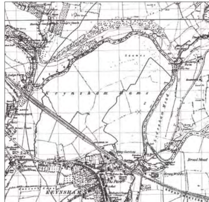
1887 PLAN - SHOWING FIELD PATTERN AND STONY PASTURES DIVIDED BY HEDGEROWS AND DRAINAGE DITCHES

The natural landform of the area has meant that historic settlement patterns favoured the ridgelines, above the floodplain. Keynsham has developed as such a settlement, overlooking the Hams and utilising them as a resource.