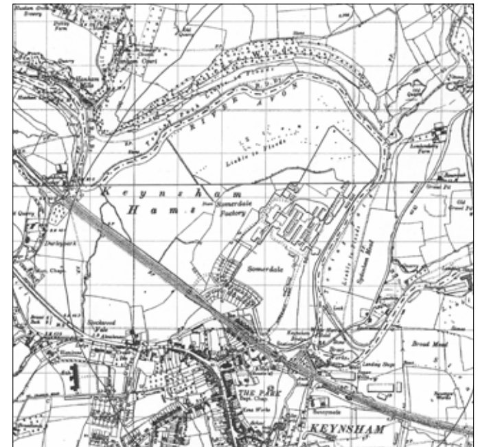
1938 PLAN - WITH SOMERDALE FACTORY DEVELOPMENT