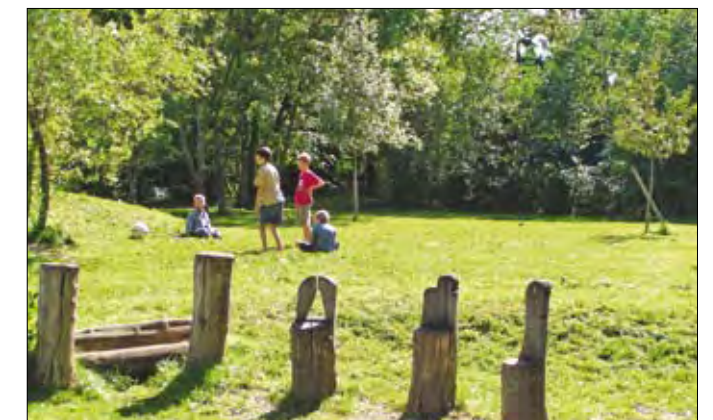
EACH NEIGHBOURHOOD OF THE NEW SOMERDALE COMMUNITY WILL HAVE AN ACCESSIBLE AREA OF INFORMAL OR FORMAL PLAY