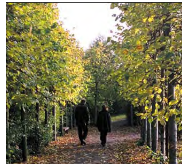
FORMAL AVENUES OF TREES WILL PROVIDE SHADING IN SUMMER MONTHS