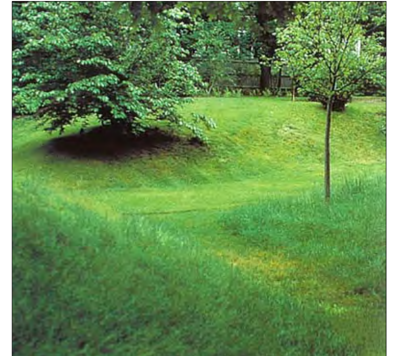
A VARIETY OF FORMAL AND INFORMAL SPACES WILL BE PROVIDED ON THE SLOPE