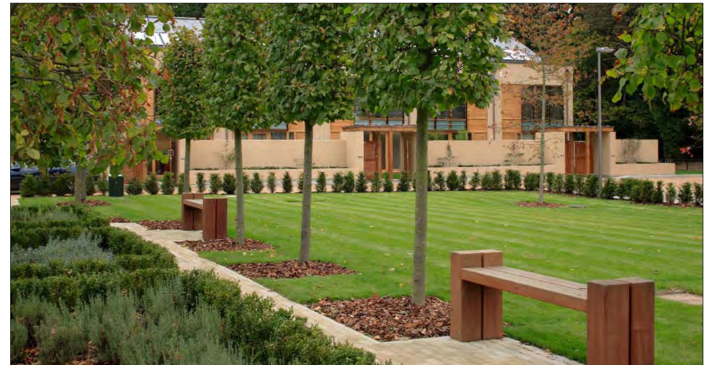
AT THE HEART OF THE NEW NEIGHBOURHOOD WILL BE RESIDENTIAL SQUARES FOR INFORMAL PUBLIC USE