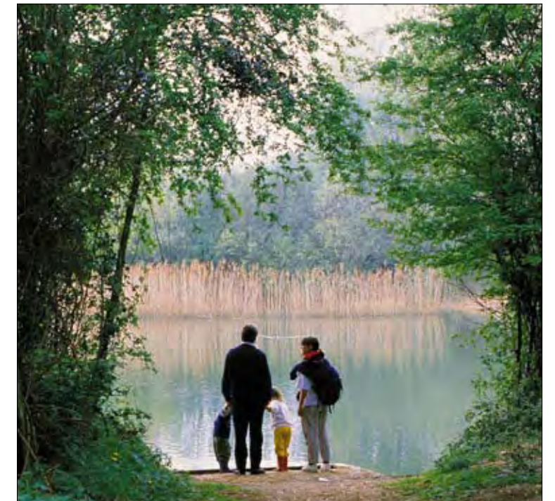
THE FRAMEWORK AND THE NEW COMMUNITY WILL HAVE A STRONG RELATIONSHIP WITH THE RIVER'S EDGE