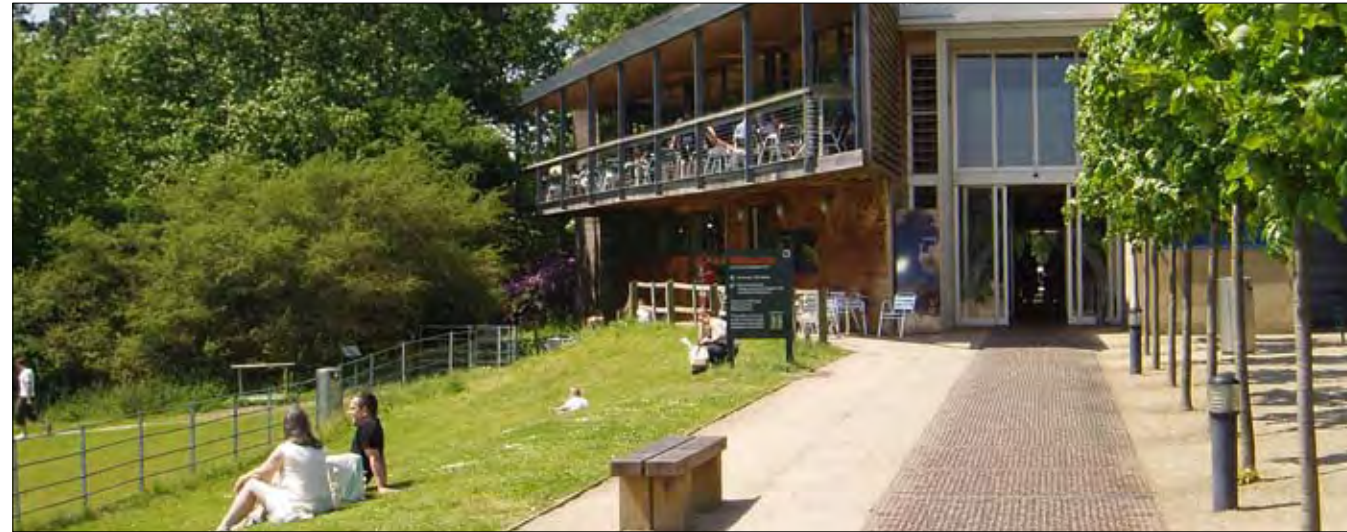
THE SLOPE WILL PROVIDE A TRANSITION BETWEEN THE DEVELOPMENT EDGE AND THE NATURAL LANDSCAPE