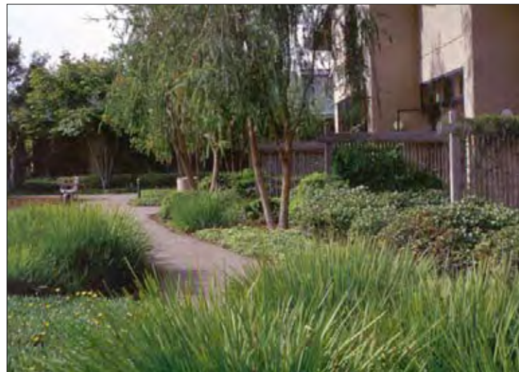
DEVELOPMENT OF THE SOMERDALE SITE WILL PHYSICALLY PROVIDE SAFE, WELL OVER-LOOKED ROUTES THROUGH THE SITE TO OPEN UP ACCESS TO THE HAMS FOR THE WHOLE TOWN