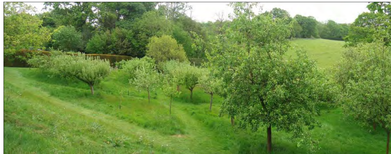
COMMUNITY ORCHARDS WILL BEAR FRUIT IN AUTUMN