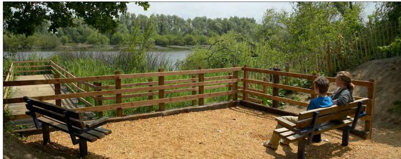
ENHANCEMENT OF THE RIVER EDGE WILL MAXIMISE THE POTENTIAL OF THE AVON CORRIDOR TO BECOME A LANDSCAPE ASSET FOR THE TOWN