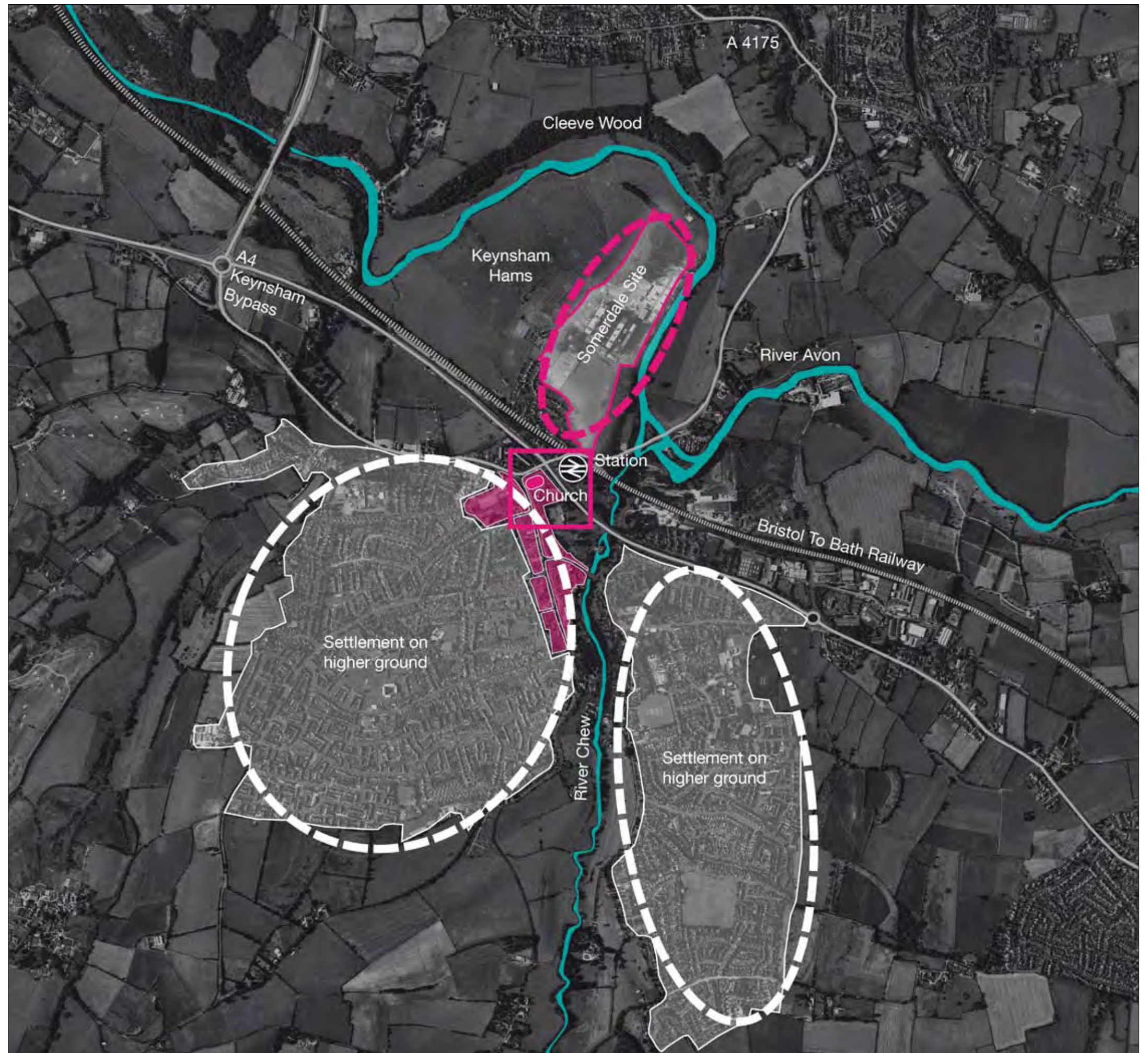
THE SETTLEMENT STRUCTURE OF KEYNSHAM WITH GROWTH TAKING PLACE ON HIGHER GROUND. THE SOMERDALE SITE IS ON A THIRD RAISED LEVEL OVERLOOKING THE FLUVIAL FLOODPLAIN, THE KEYNSHAM HAMS