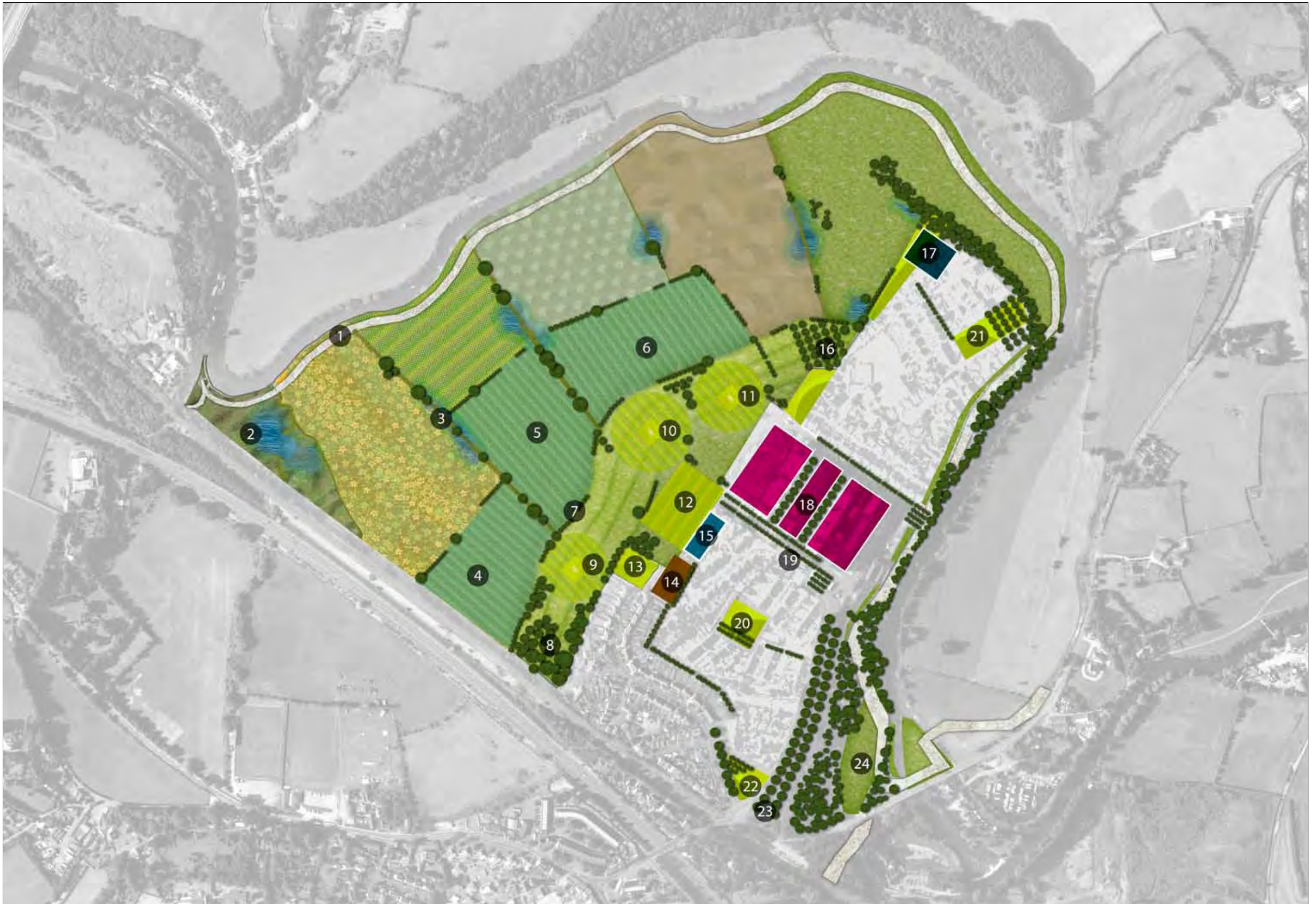
THE MASTERPLAN IS INFLUENCED BY IT'S RELATIONSHIP WITH THE SURROUNDING LANDSCAPE AND A VARIETY OF SPACES CREATE A STRONG BOND BETWEEN THE NEW NEIGHBOURHOOD AND IT'S LANDSCAPE. IMPORTANTLY THE NEW COMMUNITY WILL GUARANTEE THE LONG TERM STEWARDSHIP OF THE AMENITY AND THE FRY CLUB PROVIDES THE STRUCTURE FOR THE LONG TERM MANAGEMENT OF THE FACILITIES.