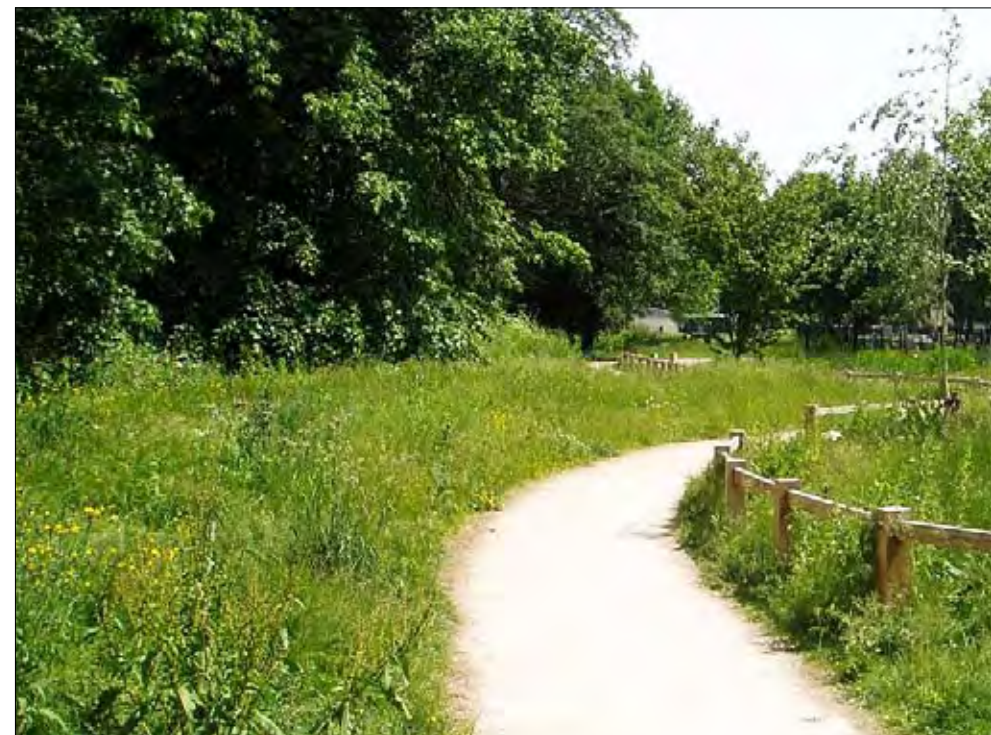
ACCESS ALONG THE RIVER CORRIDOR WILL BE SET BACK TO PRESERVE THE INTEGRITY OF THE RIVER BANKS AND ALLOW FOR PLANTING TO REPAIR AREAS OF EROSION