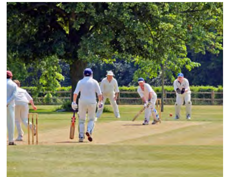
THE SLOPE WILL PROVIDE CRICKET PITCHES IN A NATURAL LANDSCAPE SETTING