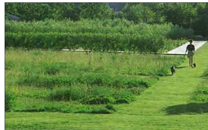
PUBLIC ACCESS WILL BE PERMITTED ACROSS THE MARSHES WITH FOOTPATHS ALONG THE HEDGEROW AND DRAINAGE DITCH FIELD BOUNDARIES