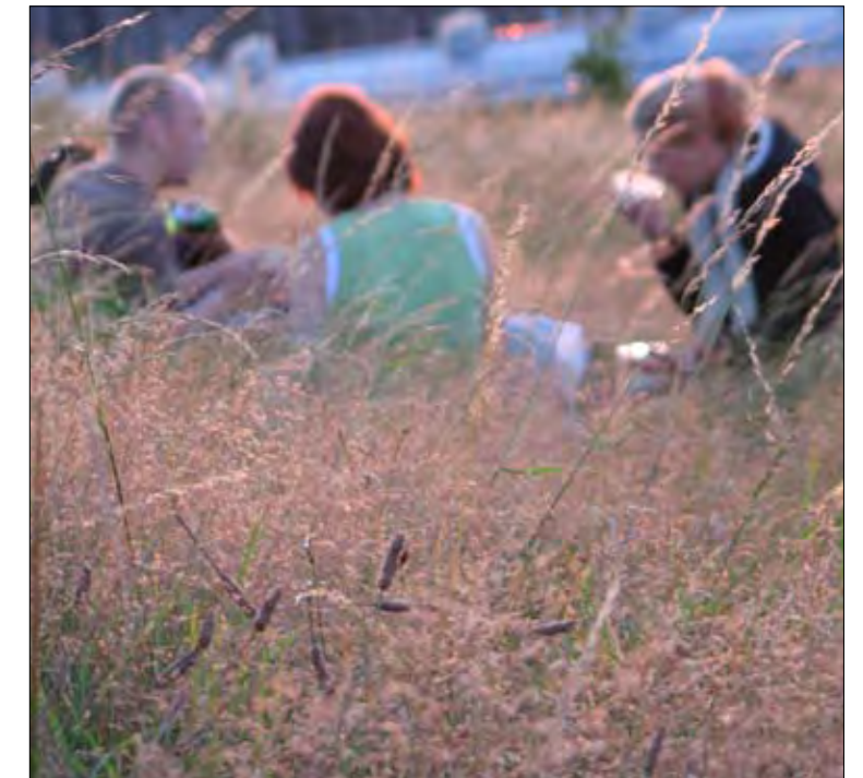
THE MARSHES WILL PROVIDE A NATURAL SETTING FOR THE TOWN TO ENJOY