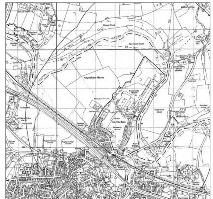
2006 - FIELD PATTERN WITH HEDGEROW AND DRAINAGE DITCH BOUNDARIES IS LOST BY INCREASED EXTENT OF RECREATION GROUNDS