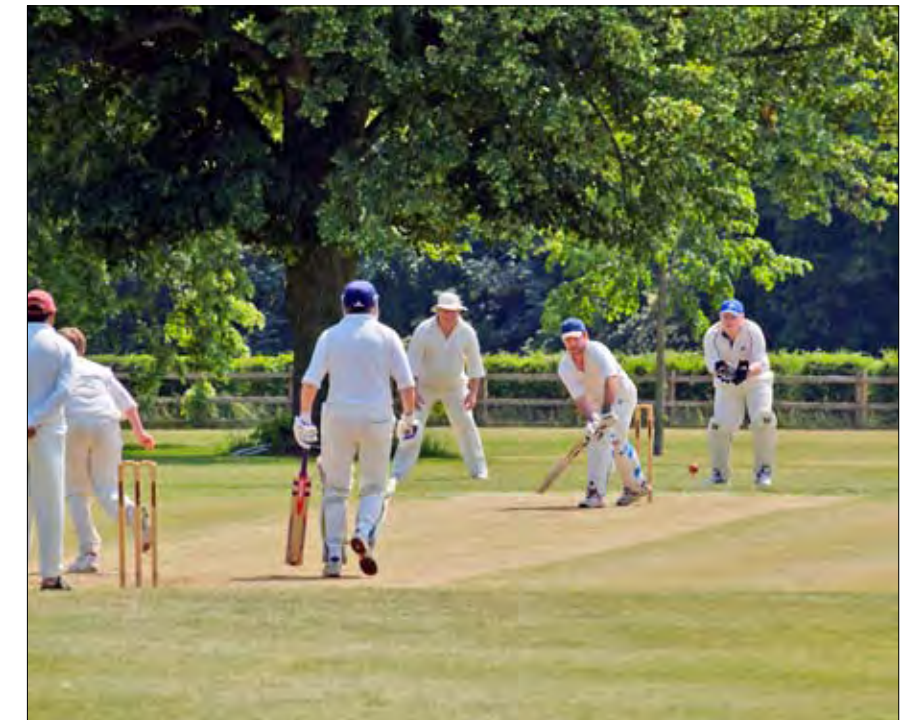
USE OF THE SPORTS PITCHES WILL BE ROTATED THROUGHOUT THE SEASONS TO MAINTAIN PITCH QUALITY THROUGHOUT THE YEAR