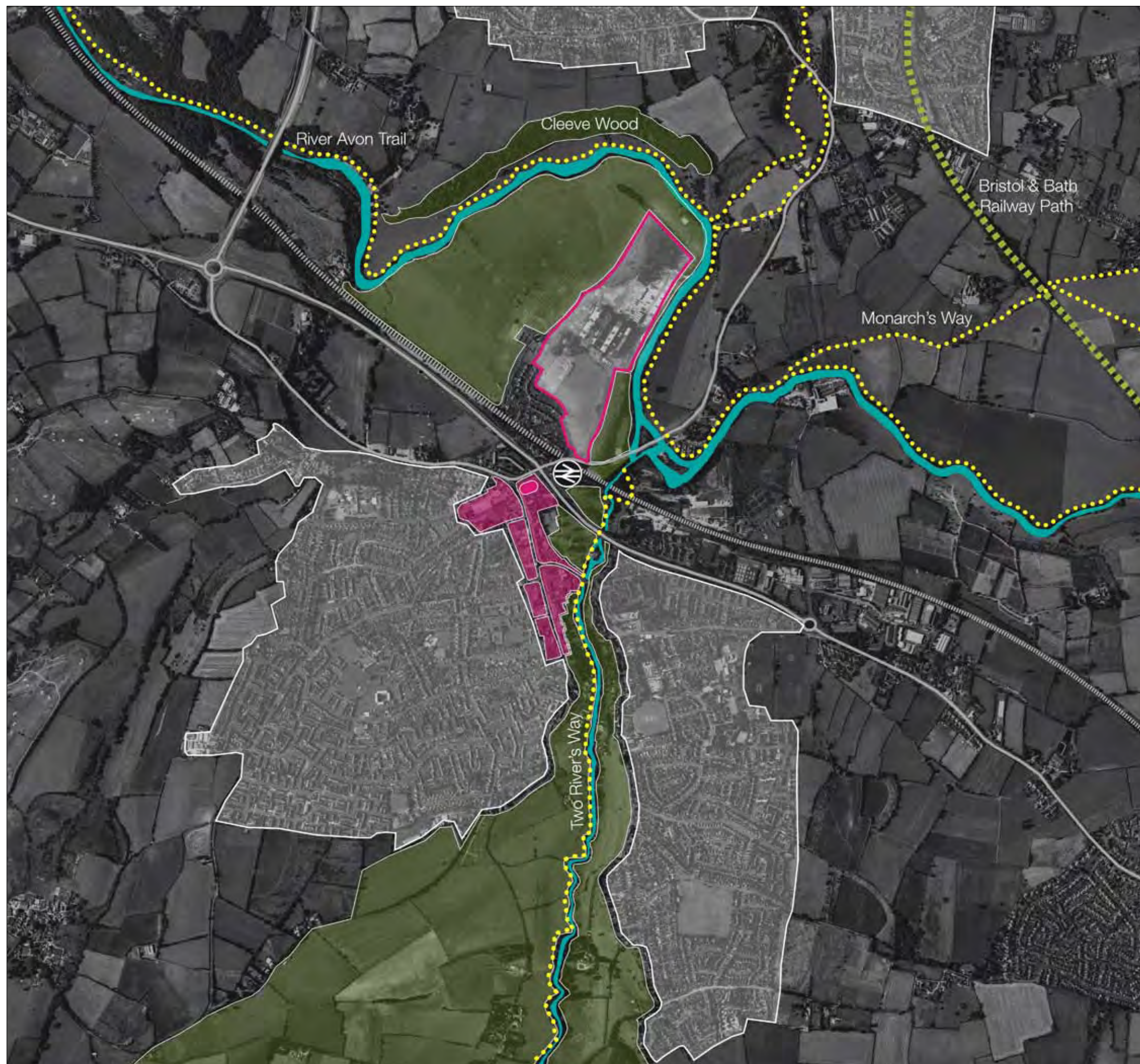
DEVELOPMENT OF THE SOMERDALE SITE PHYSICALLY OPENS UP ACCESS TO THE SURROUNDING LANDSCAPE FOR THE WHOLE TOWN. THIS VARIETY OF AMENITY SPACES AND NATURAL RESOURCES THAT THE FRAMEWORK CAN DELIVER WOULD BECOME A REAL ASSET FOR THE TOWN.

The Hams lies at the nexus of a number of long-distance footpaths and adjacent to other recreational routes and strategic cycleways, such as the River Avon Trail and the Two Rivers Way. As such, there is tremendous potential to improve links with the wider landscape.