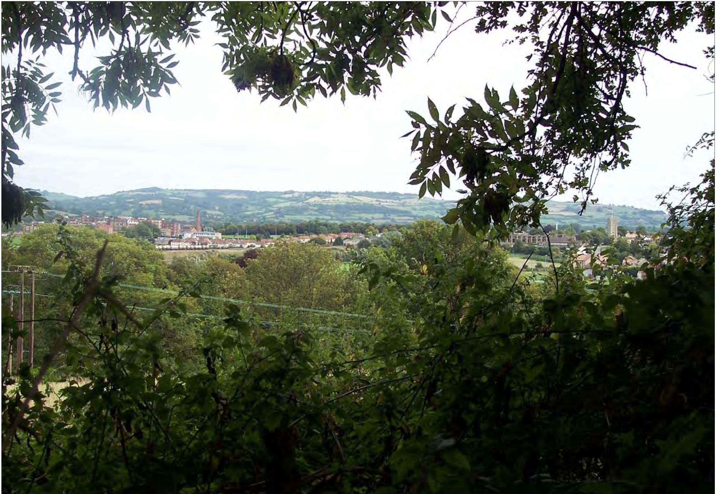
VIEW OF KEYNSHAM FROM THE WEST SHOWING THE SETTING OF THE SOMERDALE SITE AND THE TOWN CENTRE IN THE CONTEXT OF THE AVON VALLEY