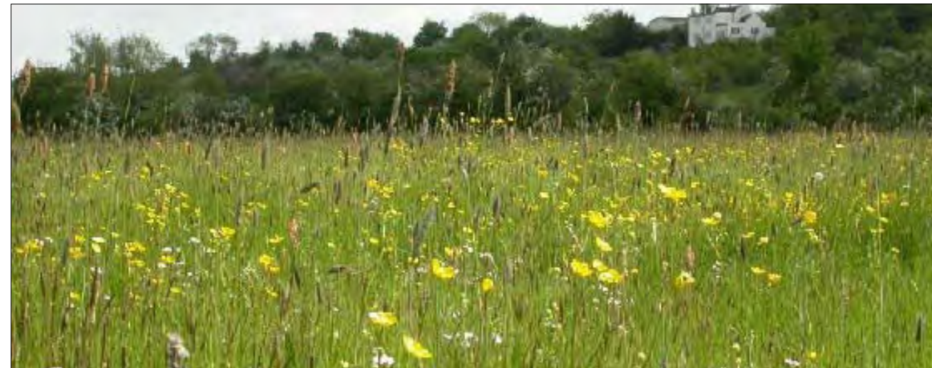
WILDFLOWER MEADOWS WILL FLOWER IN SPRING AND SUMMER AFTER GRAZING