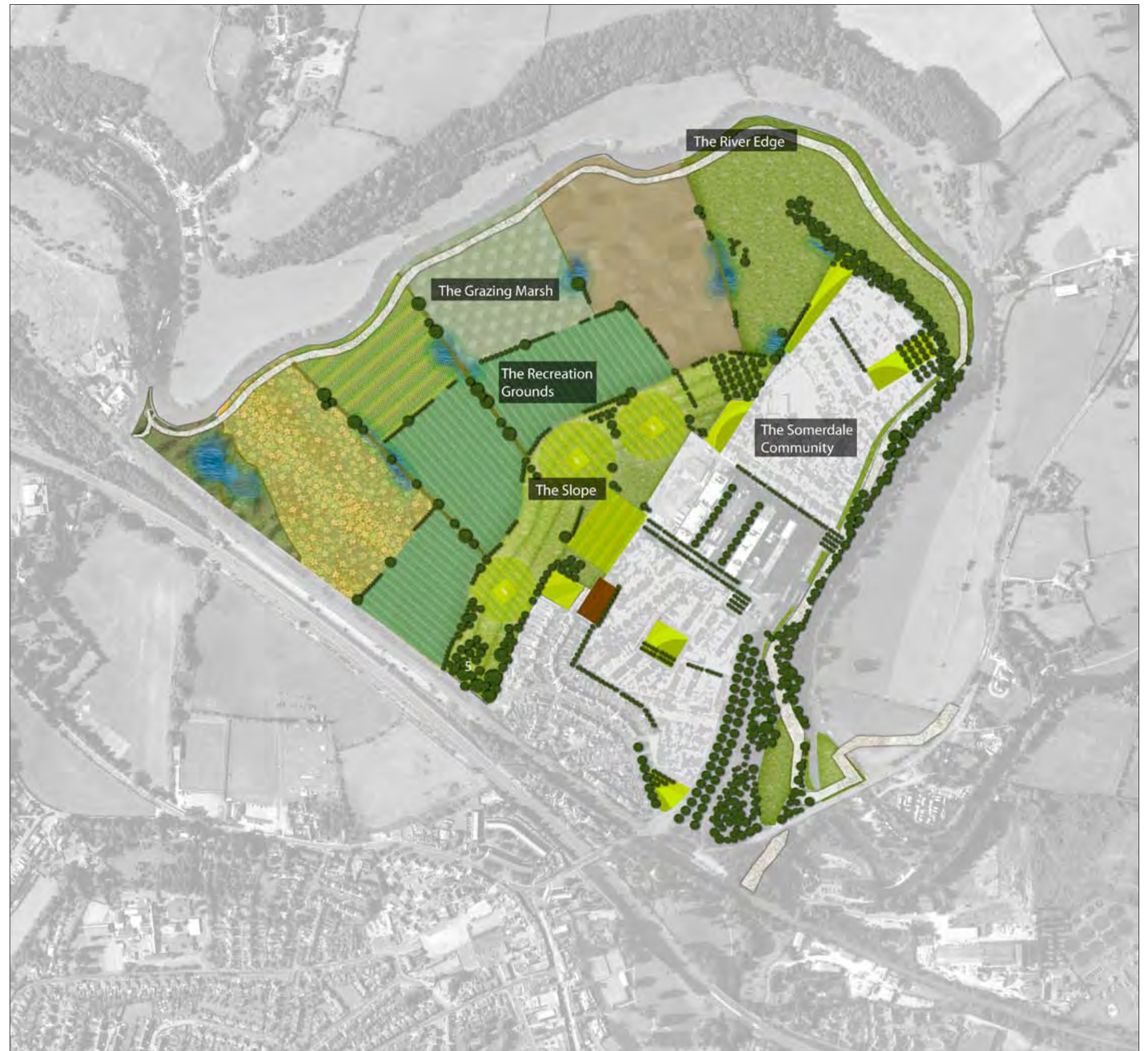
THE LANDSCAPE FRAMEWORK WHICH COMPRISES FIVE DISTINCT CHARACTER AREA'S; THE RIVER EDGE, THE GRAZING MARSH, THE SLOPE, THE SOMERDALE COMMUNITY AND THE RECREATION GROUNDS.

■ A mixed use neighbourhood with high quality civic spaces based around the existing site structure, with tree-lined streets and open spaces serving the Somerdale Community and linking it with the rest of Keynsham.