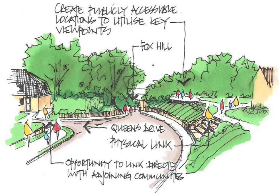
Figure 6 – Integrated with neighbouring areas