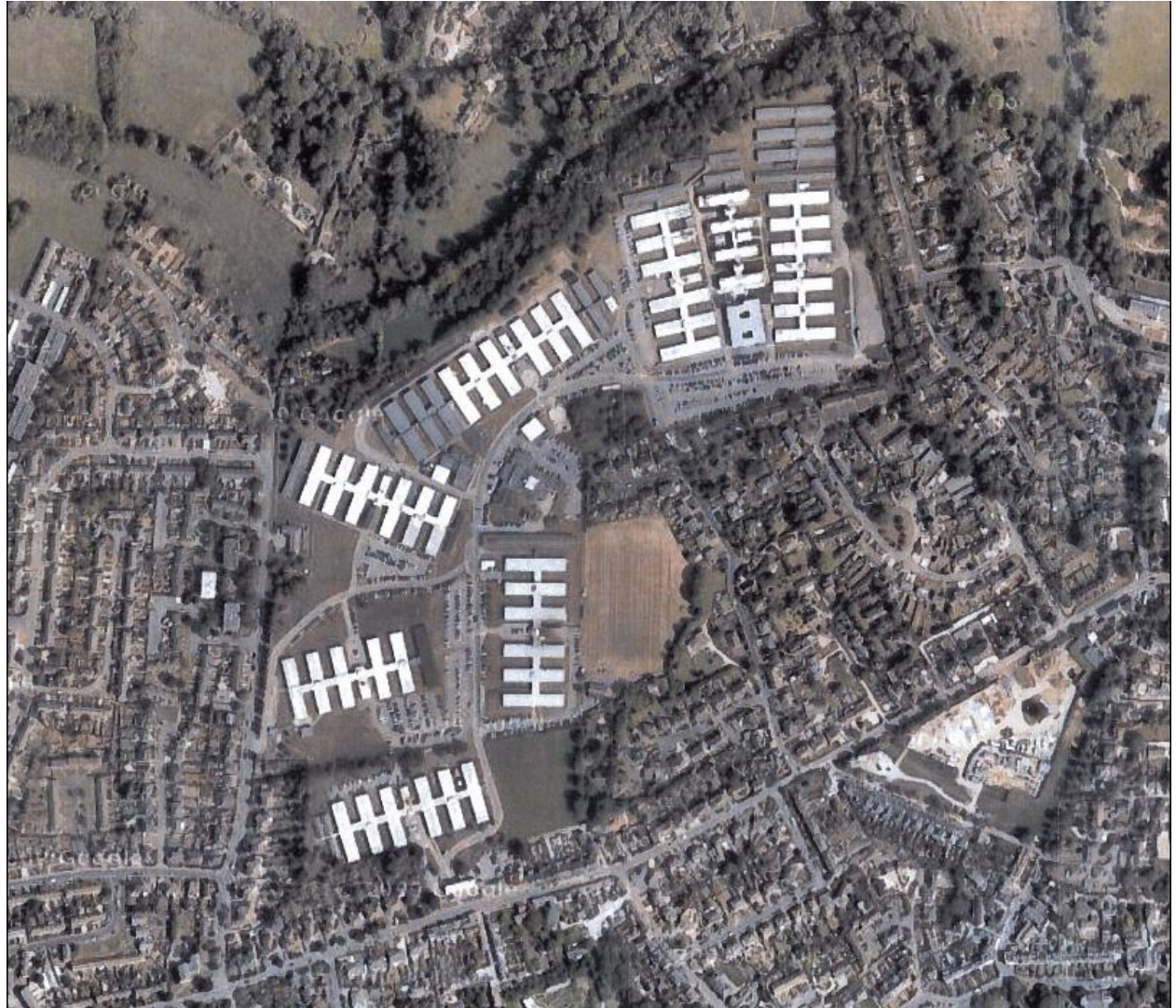
Figure 1 – Aerial photograph showing the site and its immediate context.

At present the site contains nine main buildings and a number of smaller buildings, together with circulation roads, car parking and grassed areas. The principal access is from Bradford Road, but there is also a secondary access from Fox Hill.