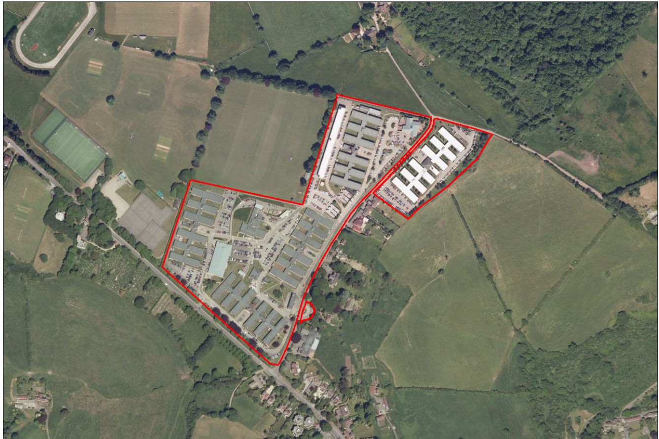
Figure 1 – Aerial photograph showing the site and its immediate context.

At present the dominant built form on site is of single story utilitarian blocks with one two storey block occupying the north west quadrant of the site. The remainder of the area is used for vehicular circulation and parking. The principal access is from Granville Road.