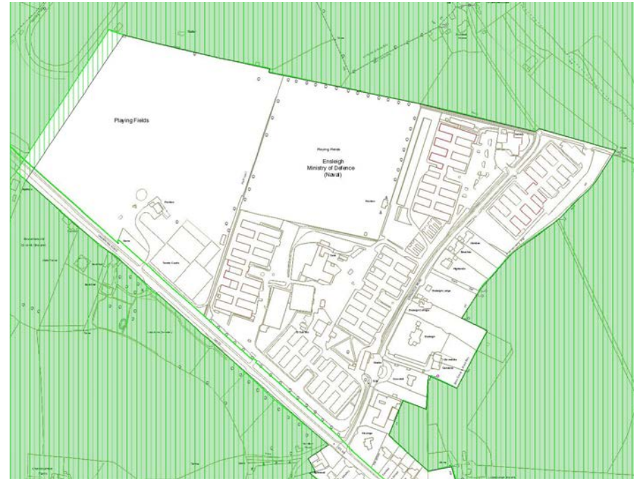
Figure 4 Extent of Green Belt and Area of Outstanding Natural Beauty shown in green and hatched area.

In this regard, it is important to note that the land to the north and west of the MoD site boundary is not in the Green Belt, nor within the Cotswold Area of Outstanding Natural Beauty (see plan below).