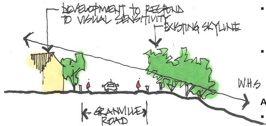
Figure 6 - Development should respond appropriately to the skyline

To be read in conjunction with the B&NES Local Plan, Draft Core Strategy, other relevant planning policies and the evidence base