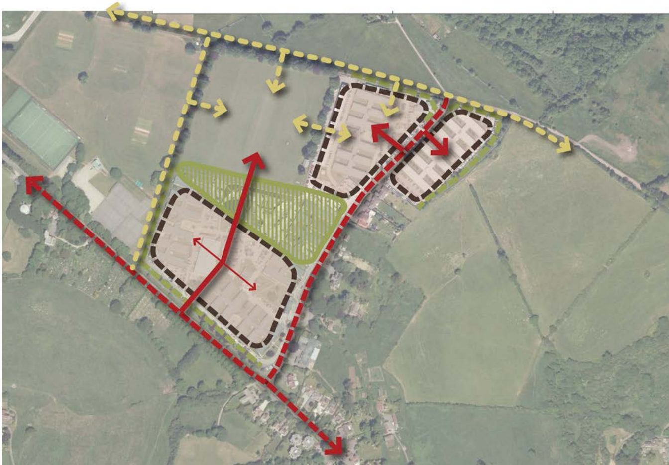
Figure 5 - Illustrative concept plan highlighting the potential connectivity within the site and to adjacent area.

To be read in conjunction with the B&NES Local Plan, Draft Core Strategy, other relevant planning policies and the evidence base