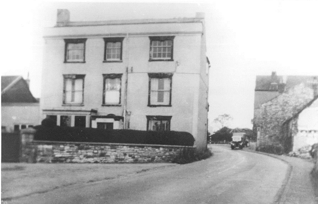
Figure 2. Clutton Brewery

The major transport route serving Clutton is the A37 with bus services to Bristol, Wells, Midsomer Norton, Radstock and Bath. From a sustainability viewpoint it would be best to site new houses as close to this route as possible. The further away a site is from this transport route, the less likelihood there is that public transport could be used and there more the likelihood that there will be the reliance on cars. To date recent development has tended to be distant from this transport route and the use of private cars in Clutton is very high compared to the average for B&NES and England as a whole (2011 Census - see appendix 7).