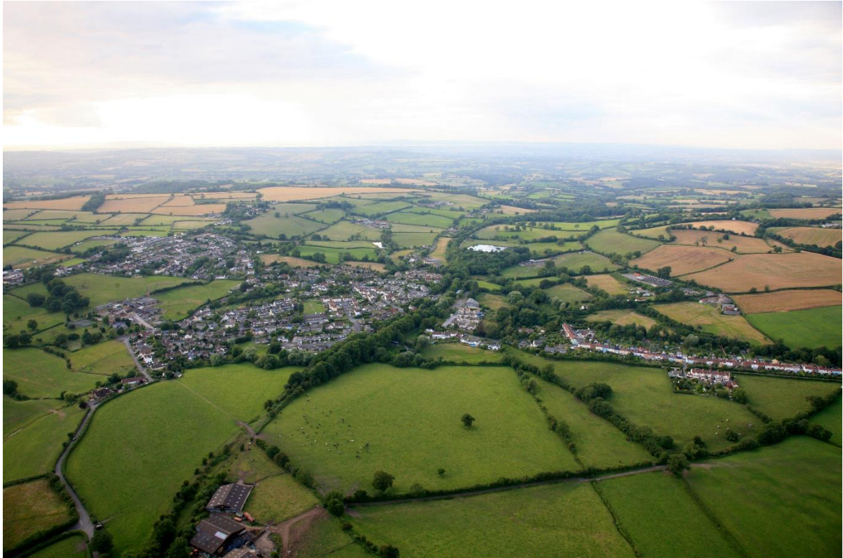
Figure 1. Clutton Village from the Air

Farming is still an important industry and the area produces some arable crops, sheep and cattle.