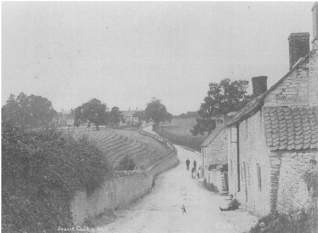
Figure 4. Cook's Hill