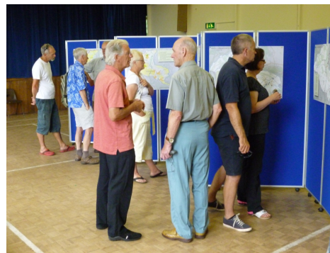
NP Surgery 20/07/13