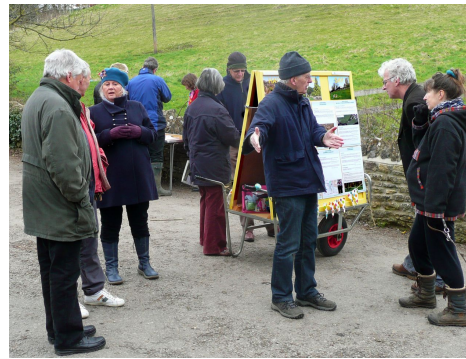
NP Surgery 02/03/13