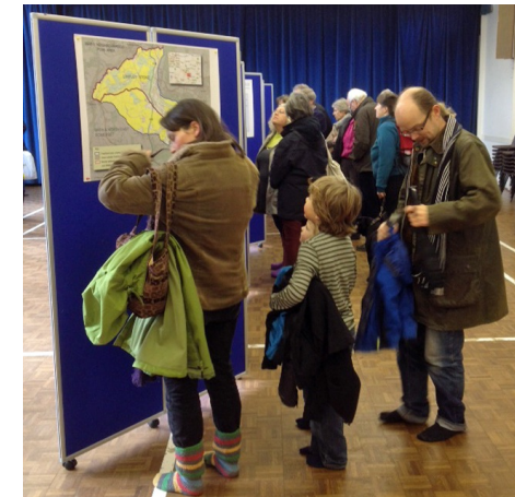
NP Surgery 11/01/14