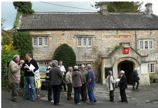
NP Surgery 13/10/12