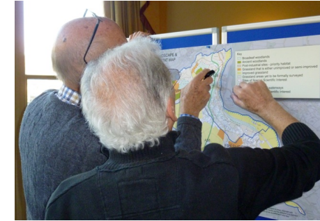
NP Surgery 11/01/14