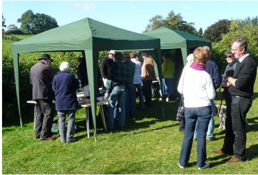
NP Surgery 29/09/12