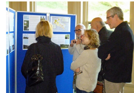
NP Surgery 11/01/14