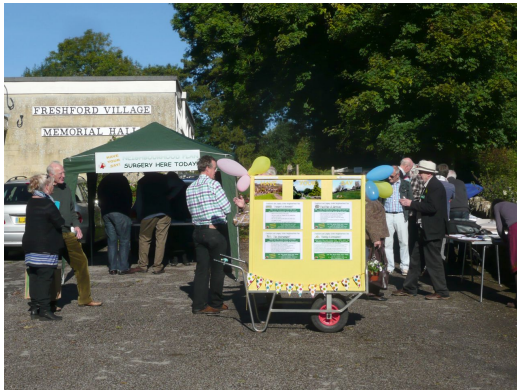
NP Surgery 06/10/12