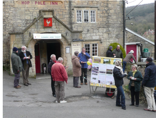
NP Surgery 23/02/13