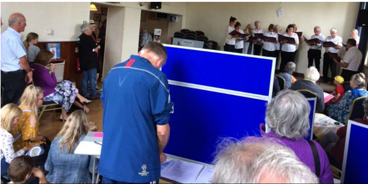
Figure 2: Options Document consultation at Stanton Drew Flower Show, July 2017, aided by the Community Choir.

Once again thank you for having your say to help shape our Parish.