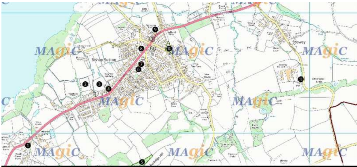
Figure 29 Map of Community assets & facilities