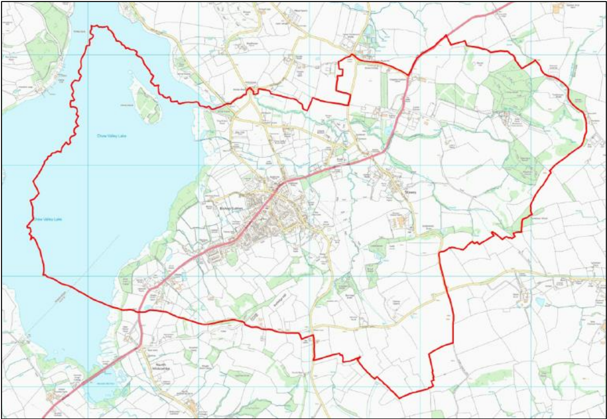
Figure 1 Map of the Stowey Sutton Neighbourhood Plan Area