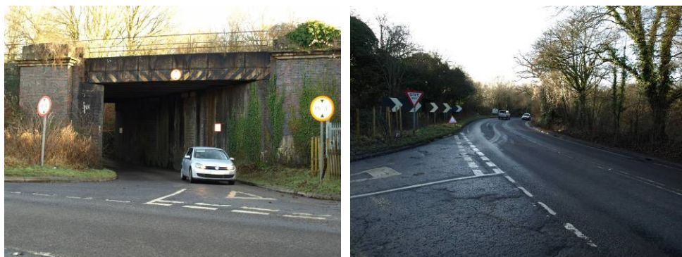
Photo 9.1 Restricted View through Bridge Photo 9.2 Poor Visibility to the Left

Drivers waiting at the give-way line to the A4 have good visibility to the right; but visibility to the left is restricted due to the alignment of the eastbound A4 approach (Photo 9.2). There is also no sheltered provision for vehicles turning right from the A4 at this junction; whilst forward visibility for drivers approaching the junction from the west is restricted. In consequence, an increased incidence of vehicles waiting to turn right in this location would increase the risk of 'shunt' accidents.