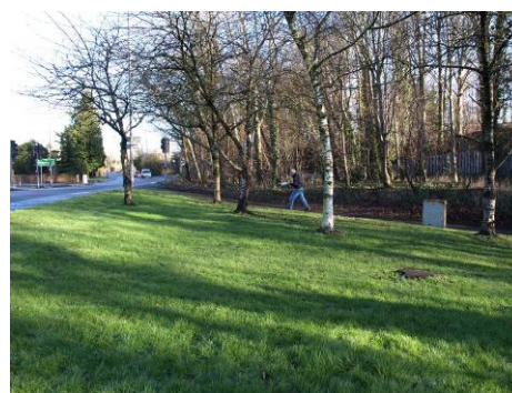
Photo 5.1 Southern Site - View from A363 Photo 5.2 Northern Area - View East from A363