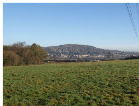
Photo 3.2 View East towards Batheaston