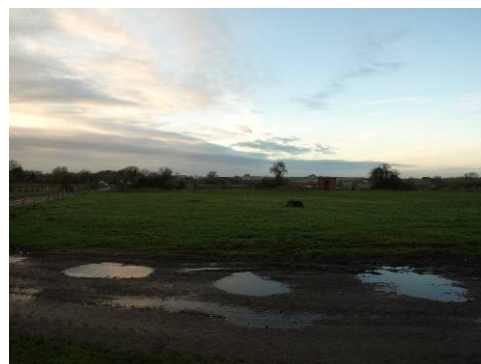
Photo 4.4 View West along Line of Access

In the wider context, the site is located within the Cotswold Plateaux and Valleys Landscape Character Area (LCA 16) as identified in the 'Rural Landscapes of Bath and North East Somerset – A Landscape Character Assessment'. This character area is defined by its geology with high, open limestone plateaux separated by dramatic scarp slopes from adjacent low-lying valley floors. The current use of the site as agricultural land aligns with the character of the wider Cotswold Plateaux.