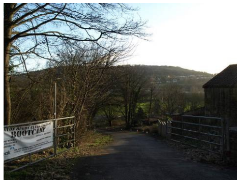
Photo 2.1 Existing Access Road

The existing access to Avon RFC is via a steep narrow roadway running down the line of the slope as shown in Photo 2.1 below. The major-minor 'priority' junction with London Road West has poor visibility to the left due to the adjoining residential property. This view to the left is further obstructed by on-street parking which occurs in front of the residential dwellings fronting this section of London Road West. However, driver visibility to the right is satisfactory as indicated in Photo 2.2.