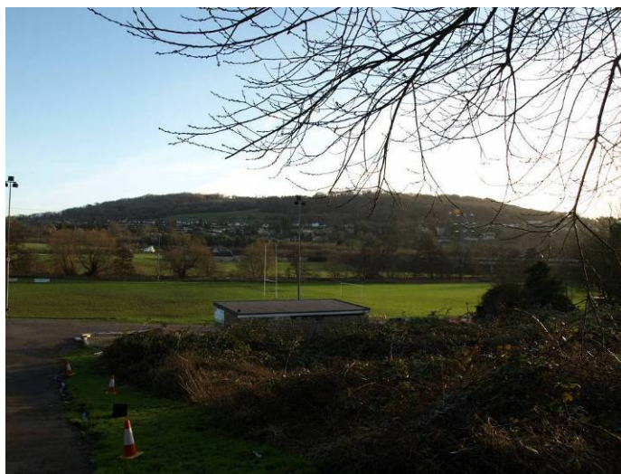
Photo 2.5 Site A - Looking South from Existing Access Road

The most likely access route to the site would descend from the current access road junction with London Road, down through an area of broadleaf woodland and scrub to the level floodplain where the park and ride facility would be located.