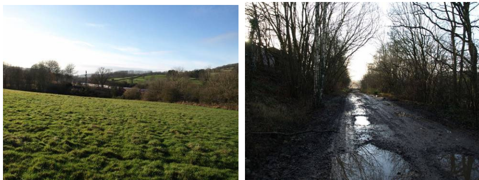
Photo 9.3 View to west from adjacent field Photo 9.4 View along the site access track