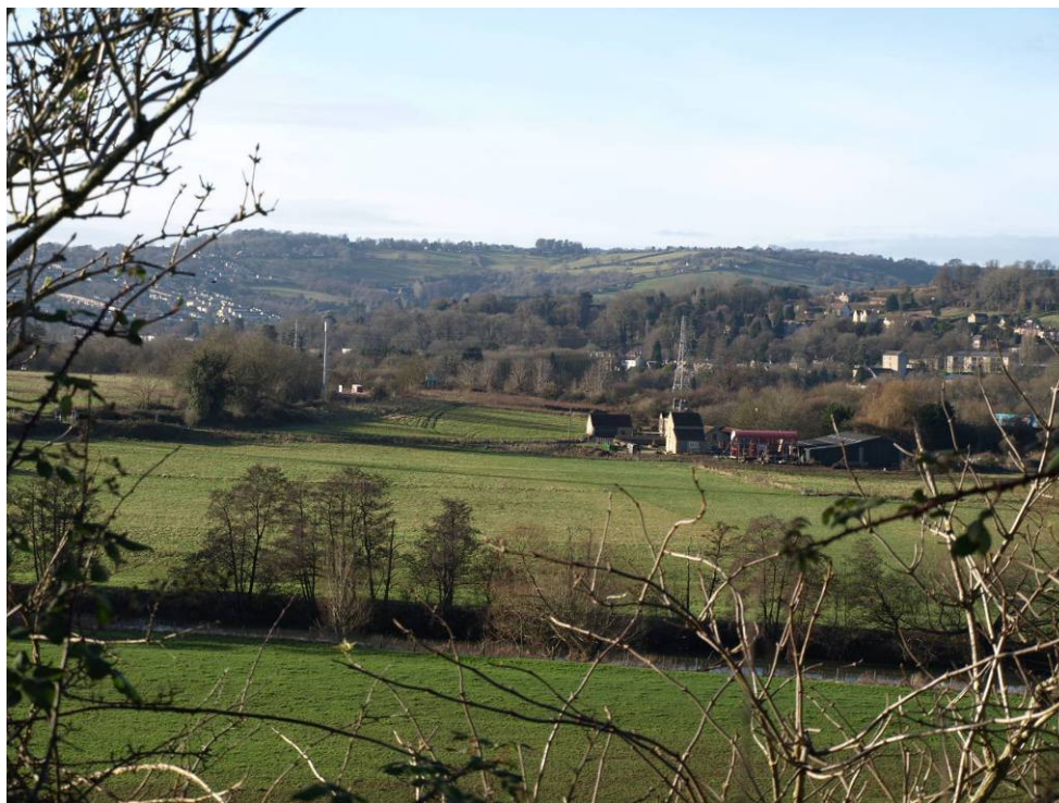
Photo 8.1 Site H: View west across the River Avon floodplain from Bradford Road in Bathford. Bathampton Farm is centre-right

In the wider context, the site is located within the Bathford and Limpley Stoke Valley Landscape Character Area (LCA 18), as described for Site A above. Whilst the pastoral use of the site identifies it as an important component of the generally rural character of the valley, the settlements of Bathford and Batheaston and the adjacent rail and road transportation routes and adjacent salvage yard exert a strong, and in the case of the latter, detracting influence on the character of the site. However, the strategic and pivotal location of the site opposite the confluence of the By Brook and Limpley Stoke valleys is important in terms of preserving the integrity of the valley landscape and the landscape quality of the site is therefore considered to be High to Moderate. Any development at this location would therefore need to be carefully assessed and designed to ensure it integrated effectively into the surrounding high quality and sensitive landscape. It appears unlikely that this would be entirely feasible with regard to the proposal for three level multi-storey car park, particularly once the re-aligned railway, new diamond interchange and slip roads off the A4 and associated box section tunnel under the mainline railway and A4 infrastructure is taken into consideration.