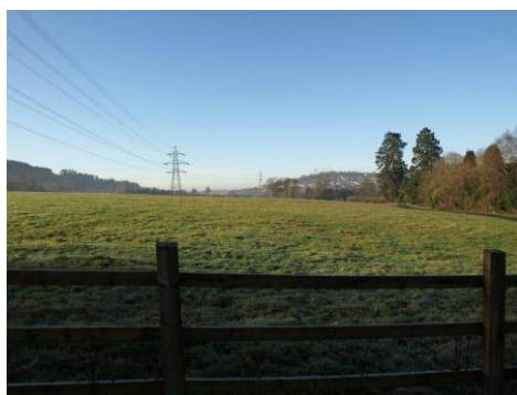
Photo 3.1 View to the West

As reflected in the designations which apply to it, the landscape quality of the site is considered High to Moderate by virtue of the fact that it forms part of and is characteristic of the wider, semi-natural valley landscape which contributes to the unique character of the city rather than the localised value of its constituent parts. However, it is not designated as part of the Cotswolds AONB nor the Bath WHS nor does it support any significant landscape features of local value, with the exception of two mature oak trees on the northern boundary and the boundary hedgerows. The presence of two electricity pylons, one on the boundary and one in the centre of the site, detracts from the intrinsic rural character of the site to a significant degree.