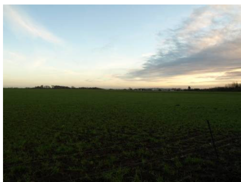
Photo 4.3 View South towards Bath

A public footpath runs across the site from north-west to south-east direction.