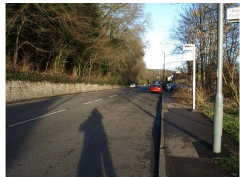
Photo 2.2 Visibility 'Envelope' to the Right

Apart from the sub-standard visibility to the left the level area in the vicinity of the junction bell-mouth only extends 5-6m back from the kerb-line; after which the steep up-grade section of the access road is reached. Whilst this provides a sufficient level waiting area for a car; it would not for an emerging bus. As such, bus drivers could experience difficulty in emerging from the junction due to the 'gap' time in priority traffic needed to exit safely. During the site visit we were also told by Avon RFC that coaches have difficulty in negotiating the steep up-grade when leaving the site now.