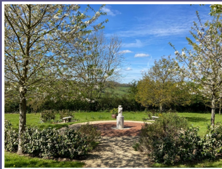
The Sands Garden

If you would like further information regarding burial, cremation, or memorials we are happy to help. Please contact the staff of Bereavement Services at Haycombe Cemetery.