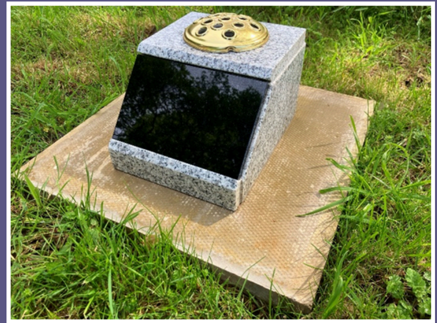
Baby Vase Block

Baby Vase Blocks are individual memorials, available for those who prefer to have their own private plot. With a backdrop of the conservation area, these high-quality granite stones provide a space just for your child. Ashes can be interred in the ground beneath if required. The memorial plaque is formed from polished black granite, featuring gold lettering, with artwork and motifs also an option. A gold-coloured flower vase is provided for each memorial, so there is always somewhere to leave floral tributes.