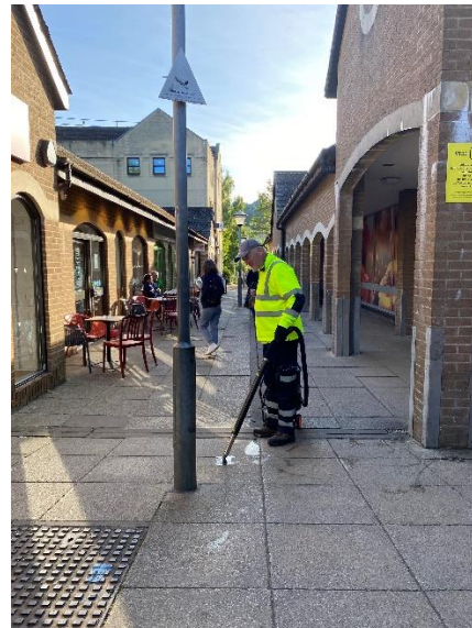
Gum removal in Bath and Midsomer Norton