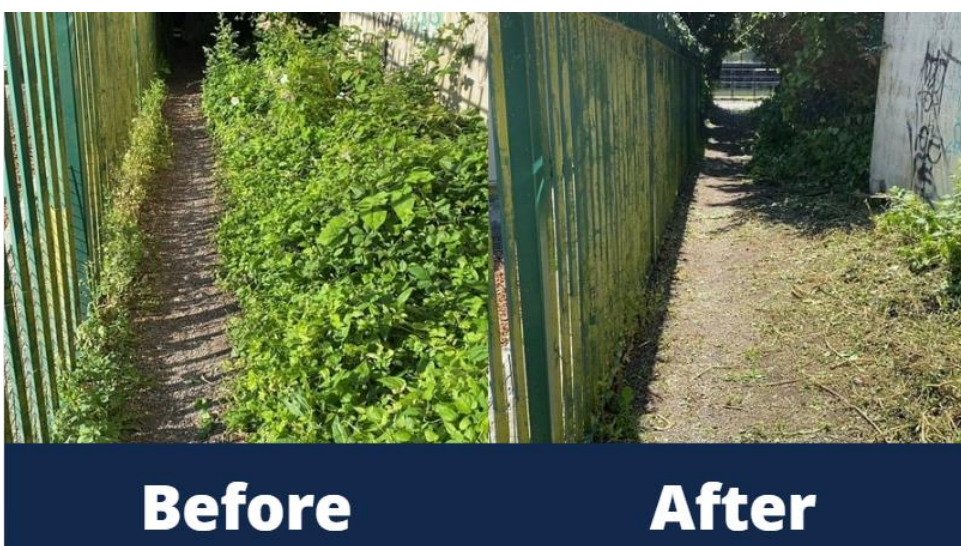
Vegetation removal at Albion Building, Bath 6/8/24