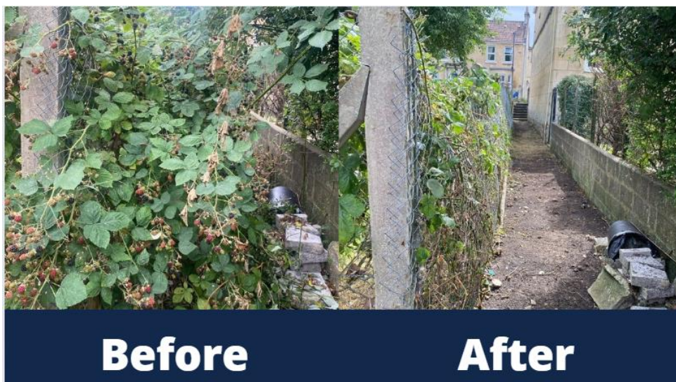
Vegetation removal at Caledonian Road, Bath 5/8/24

Here are some examples of the work completed: