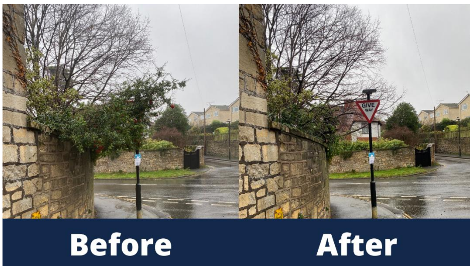
Overgrown vegetation trimmed back to reveal giveaway road sign on Englishcombe Lane, Moorlands