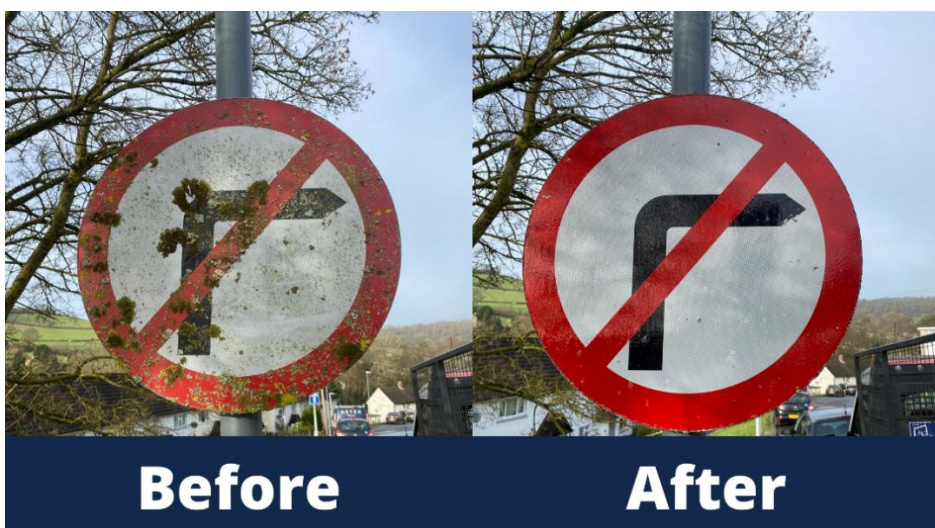
Road signs washed on Elmhurst Estate and Catherine Way in Bathavon North