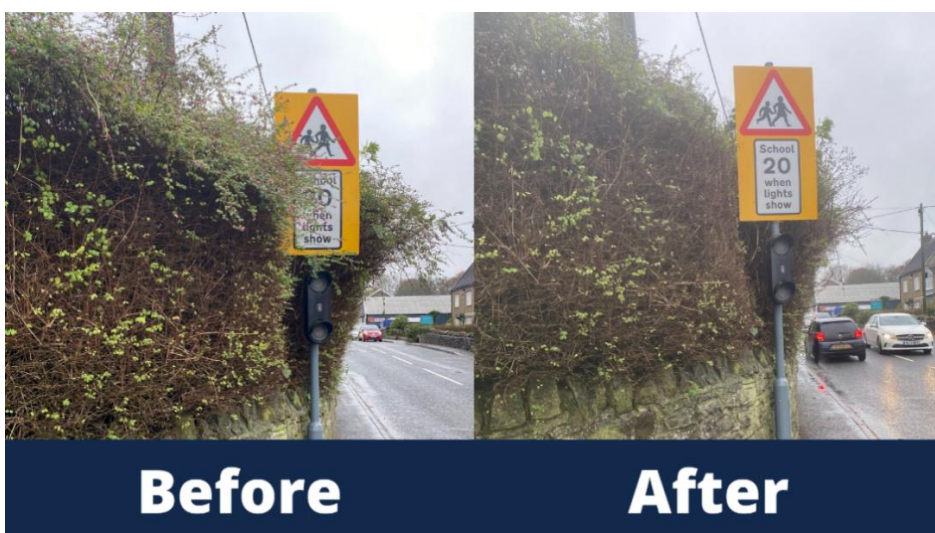
Vegetation cleared away from signage in Southover A39, High Littleton