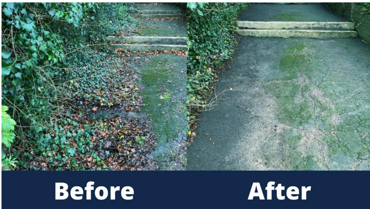
Weed removal completed along laneway at Southlands Drive, Timsbury ward