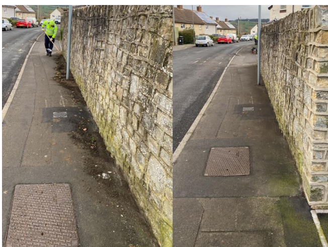
Weeds removed and sweeping completed along Bath Road, Manor Road, and Norman Road in Saltford