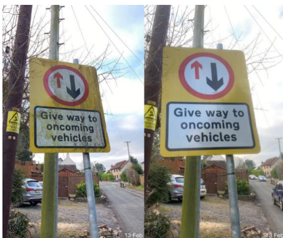
Before and after pictures of road signs washed in Stoke Hill, Chew Valley