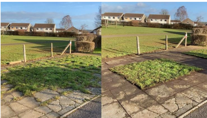
Weeds cleared and sweeping completed at Ash Tree Court, Westfield

The Clean and Green Response team responded to 67 reports in February related to overgrown vegetation, dirty signs, graffiti, tree and woodland issues and litter. Since June 6, the team have responded to 973 reports and fixed or closed 885 of them. Some reports are still in progress.