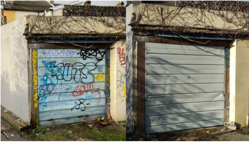
Graffiti removed from a garage and the side of a residential property in Westmoreland