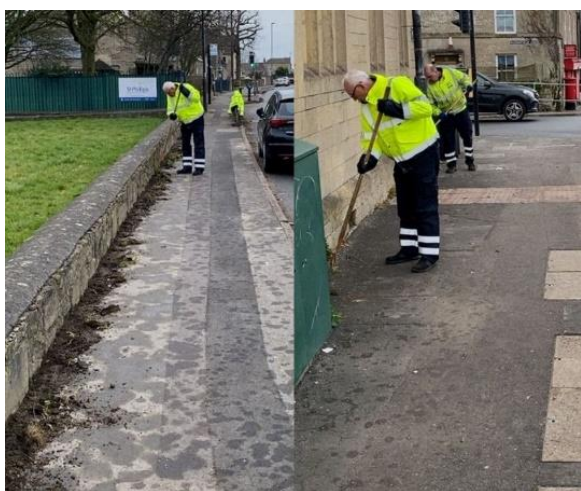
Weeding and sweeping completed along Upper Bloomfield Road and Frome Road, Combe Down