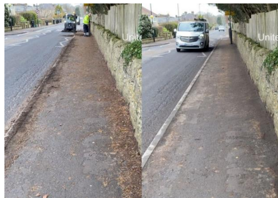
Weeds and leaves cleared along North Road, Odd Down