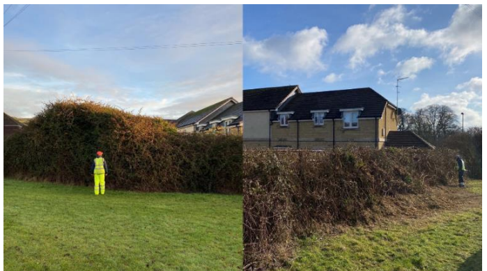
Overgrown vegetation cut back near Weston Recreation Ground, Weston