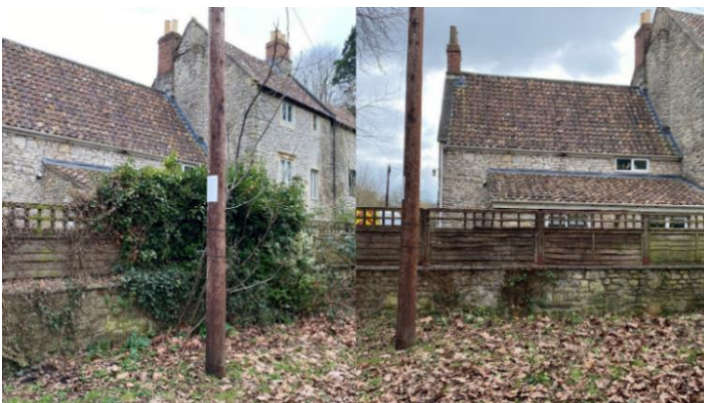
Overgrown hedge trimmed near The Shallows in Saltford