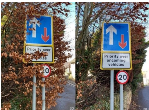
Overgrown vegetation removed from road signs throughout Camerton in Bathavon South