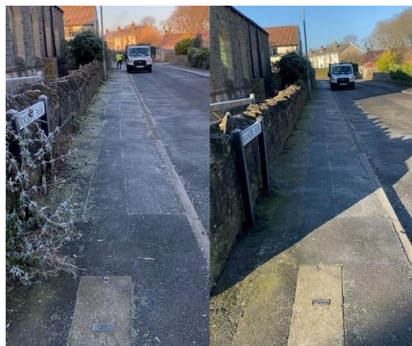
Sweeping, weed removal and litter picking completed throughout Manor Park, Radstock