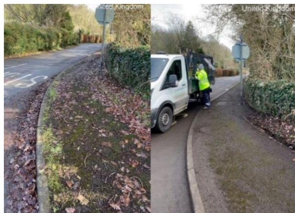
Weeding and sweeping completed along Bridge Place Road in Camerton