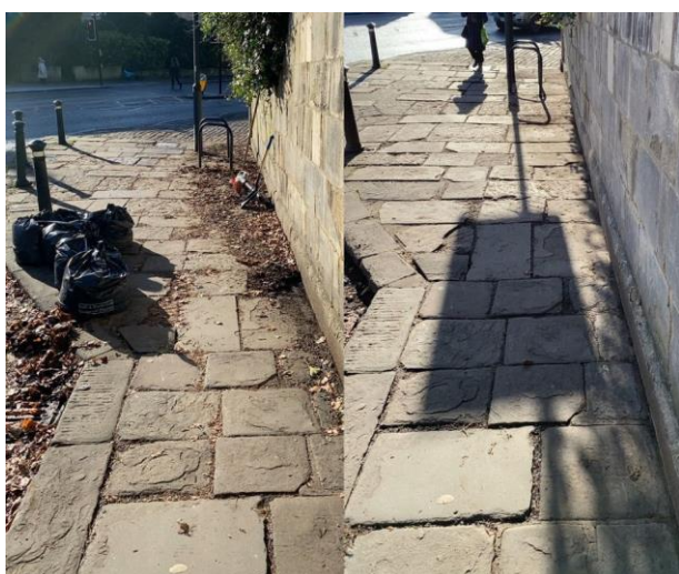
Sweeping and weed removal completed along London Road from Morrisons up towards Grosvenor Place