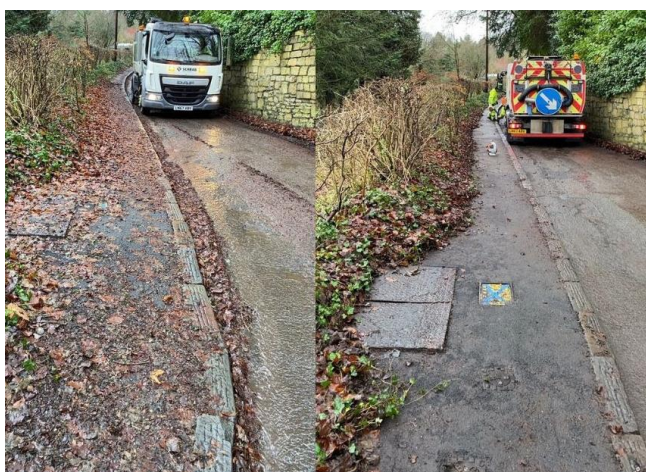
Sweeping completed along Fox Hill and Perrymead, Widcombe and Lyncombe