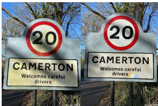
Dirty signs cleaned throughout Camerton in Bathavon South