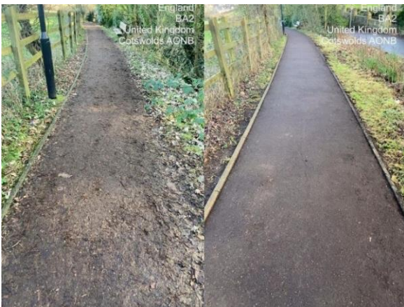
Sweeping completed along Freshford Lane footpath in Freshford

The Clean and Green Response team responded to 128 reports in January related to overgrown vegetation, dirty signs, graffiti, and litter. Since June 6, the team have fixed and closed 856 related reports.