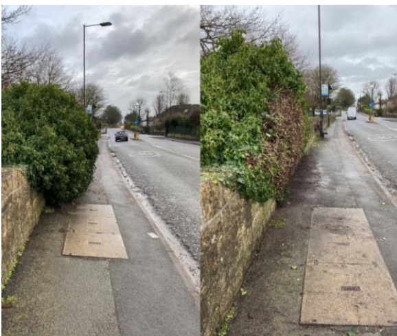
Overgrown vegetation removed along Bradford Road in Combe Down