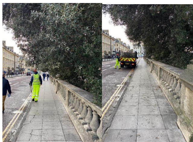
Overhanging vegetation cut back along North Parade in Bath city centre