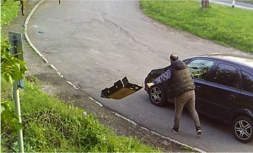
Littering caught on a B&NES camera in Dunkerton, Bathavon South

This month, 38 fixed penalty notices were issued from Environmental Enforcement related to commercial waste, littering, fly-tipping, and escape of controlled waste. One of the B&NES cameras caught a man throwing litter in a layby in Dunkerton Hill. He was subsequently issued with a fixed penalty notice of £100.