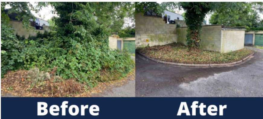
Overgrown vegetation cut back in Clyde Gardens, Twerton