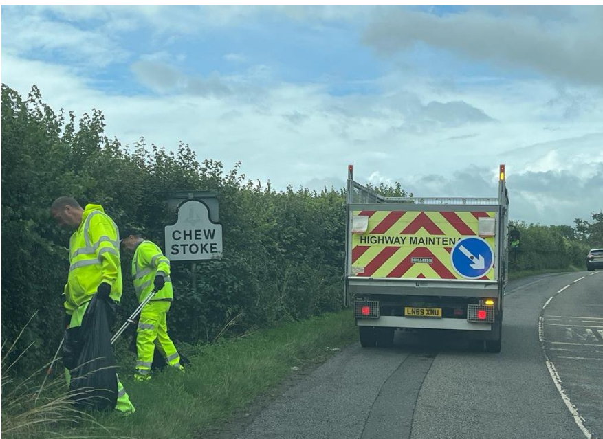
Main road litter picking on Pagans Hill in Chew Stoke, Chew Valley

This year's investment will support increased main road litter picking on A4, A39 and A37. Recently Street Cleansing visited Limeburn Hill and Pagans Hill and cleared 59 bags of litter.