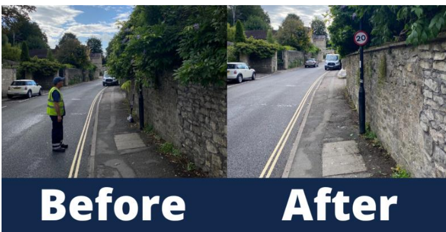
Overhanging vegetation trimmed on Weston Lane to allow visibility of 20mph road sign in Weston ward