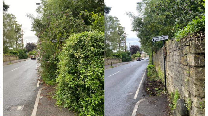
Vegetation blocking pavement cut back on Pines Way in Oldfield Park