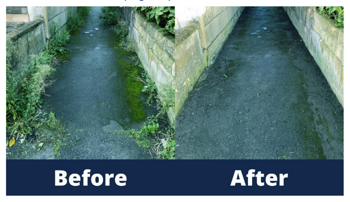
Weeds cleared along laneway at Third Avenue in Oldfield Park