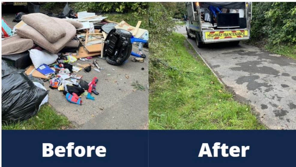
Durley Hill, Keynsham 1/10/24

To report fly-tipping in B&NES, please visit: https://beta.bathnes.gov.uk/report-fly-tipping