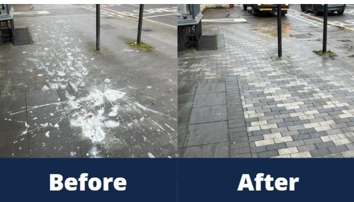
London Road, Walcot 14/10/24