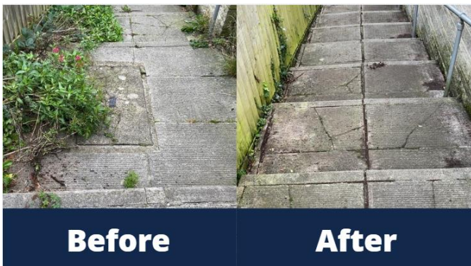
The Hollow, Southdown 2/10/24

The Clean and Green teams are responding to litter picking, weeding, sweeping, overgrown vegetation, cleaning of signs and woodland issues. The Cleansing and Response teams fixed and closed 132 reports this October and November including: