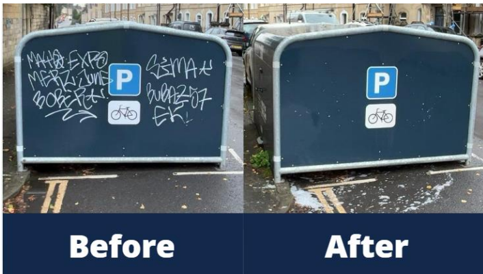
Camden Road, Becon Hill, Bath 14/10/24

Clean and Green continue to remove graffiti from council buildings, road signs and litter bins. In October and November 16 sites were cleared of graffiti including: