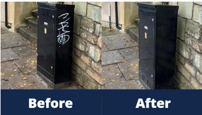
Beacon Hill, Bath 14/10/24