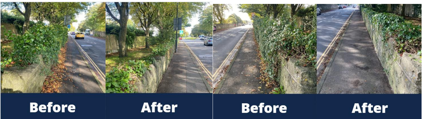
Wellsway, Bath 11/10/24