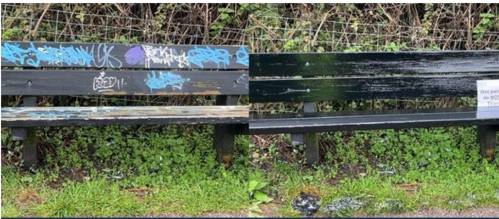
Mill lane, Bathampton 9/10/24