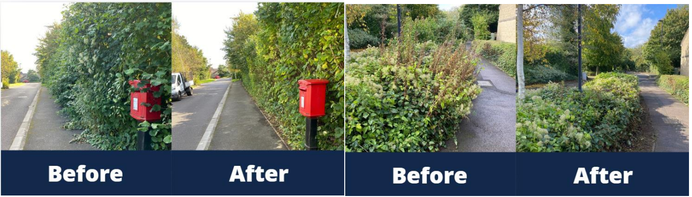
Sulis Manor Road, Odd Down 8/10/24