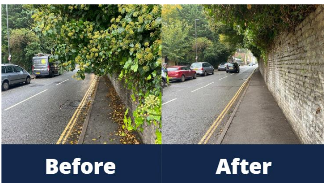
High Street, Weston Village