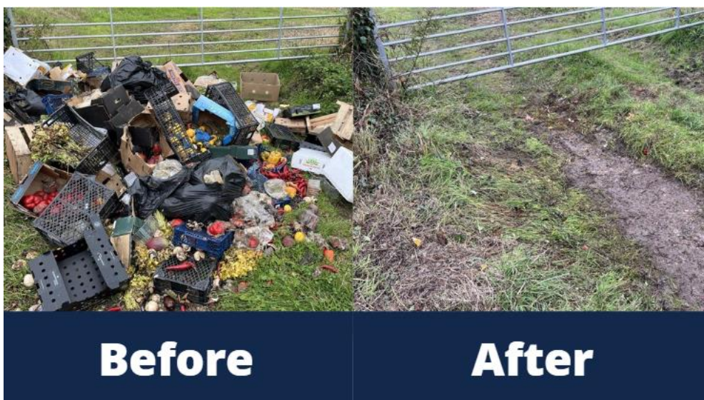
Englishcombe Road, Englishcombe, Bath 2/10/24

Unfortunately, no evidence was found on either of these occasions.