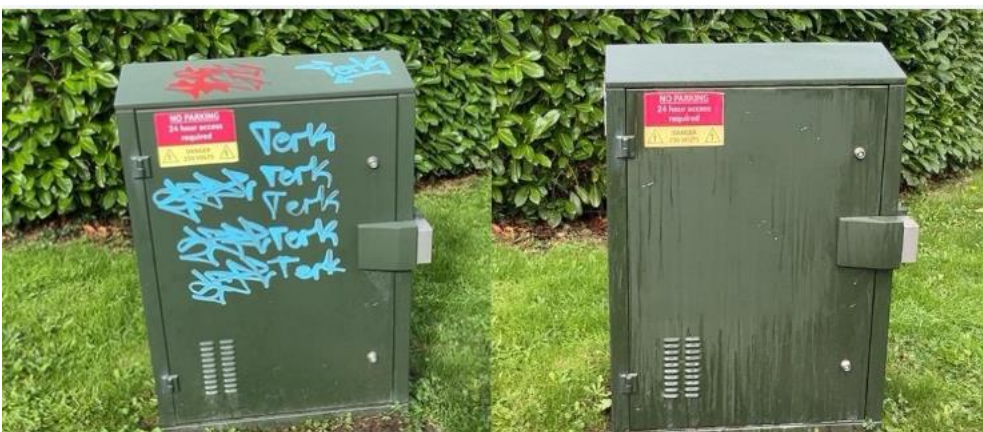
Canal Terrace, Bathampton 9/10/24