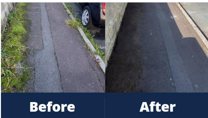
Hillcrest Pensford 3/10/24