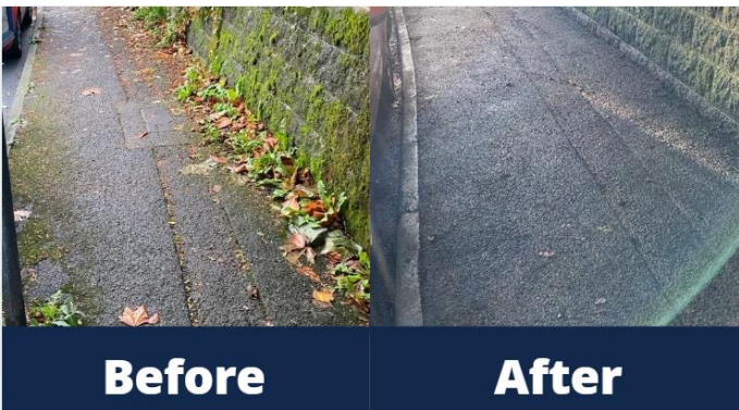
Shophouse Road, Twerton 9/10/24