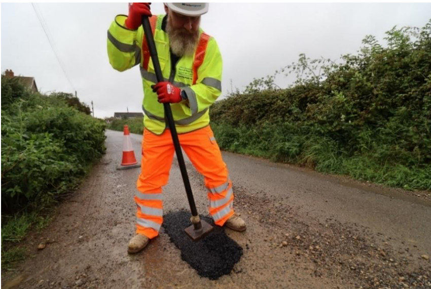
Highway Inspector repairing pothole in Upton Lane, Chew Magna

Clean and Green's funding supports Highways maintenance budget for roads, filling of grit bins and gully emptying. The team inspected 1850 gullies of which 1505 were cleaned in September.