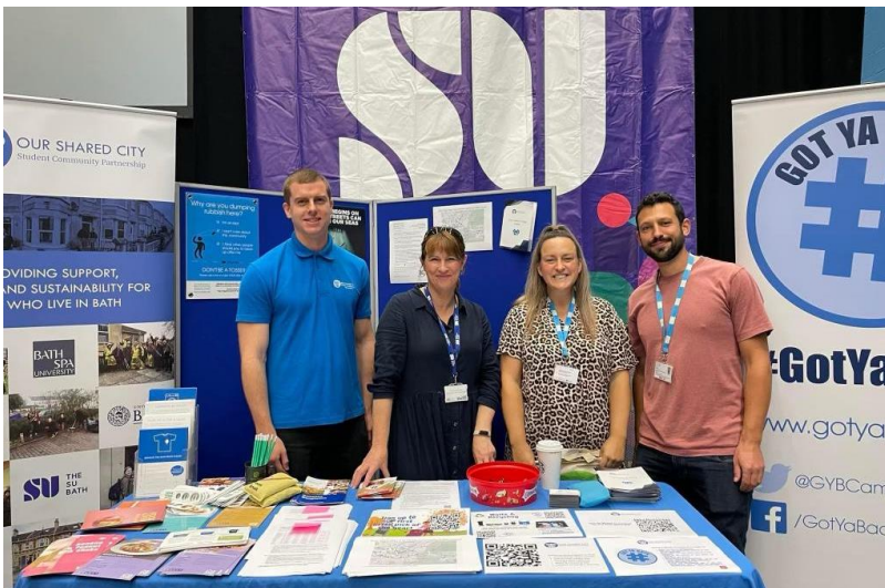
The Student Community Partnership and the Waste Education team at University of Bath's Freshers' Fair

A digital waste education leaflet has also been sent to all letting companies across B&NES, which can be circulated to all new occupants in rented accommodation.