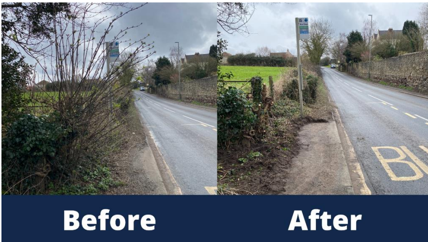
Vegetation cut away from bus stop on Lower Bristol Road, Clutton and Farmborough