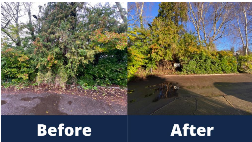
Vegetation trimmed and sweeping completed in Charlotte Street car park, Kingsmead