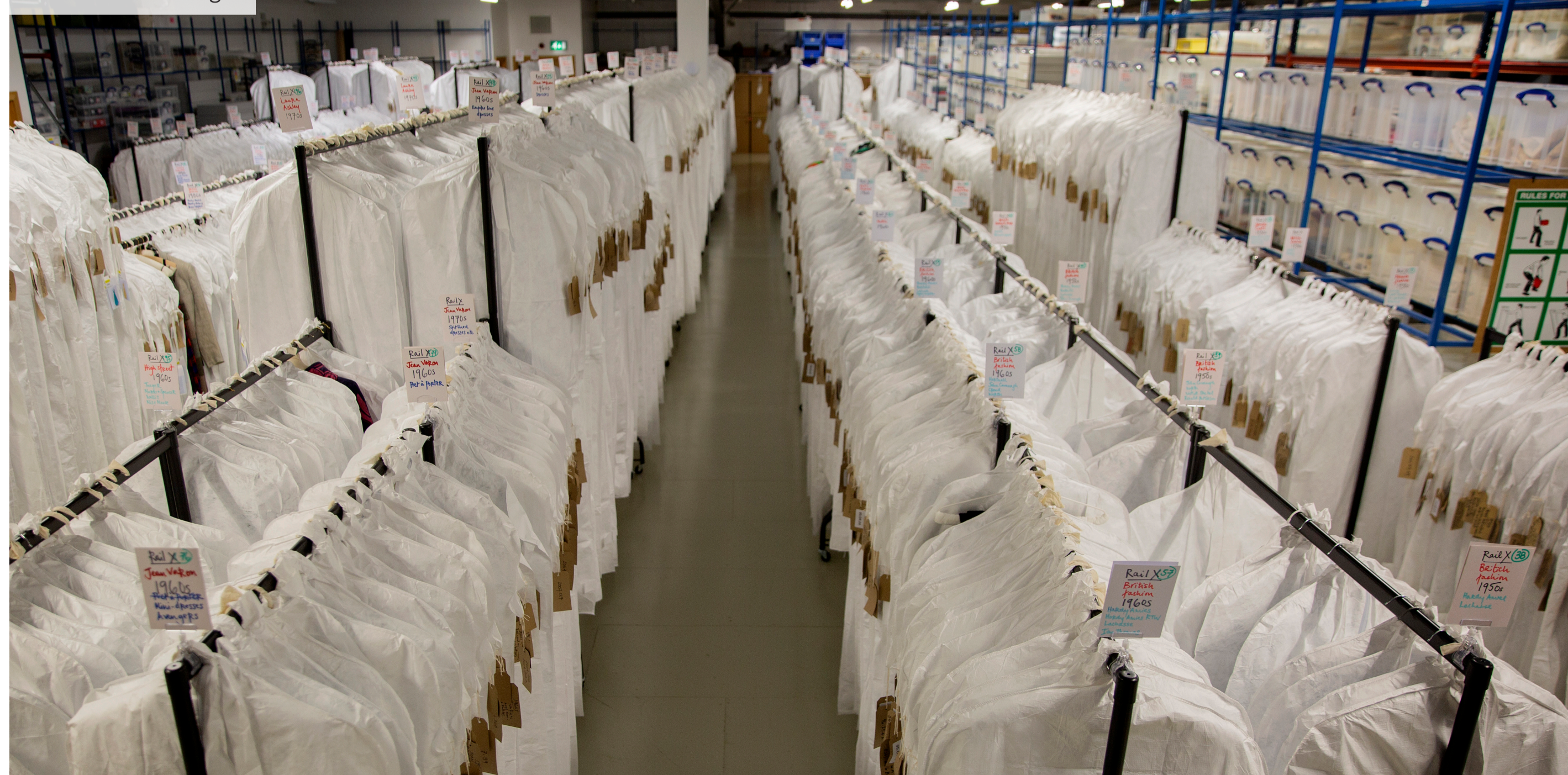
Collection in Storage

The Fashion Museum collection takes up nearly one kilometre of hanging/shelving space; it is also stored in five and a half thousand boxes.