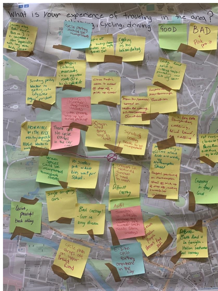
Map 2. Participants’ experiences of travelling through the Lower Lansdown area