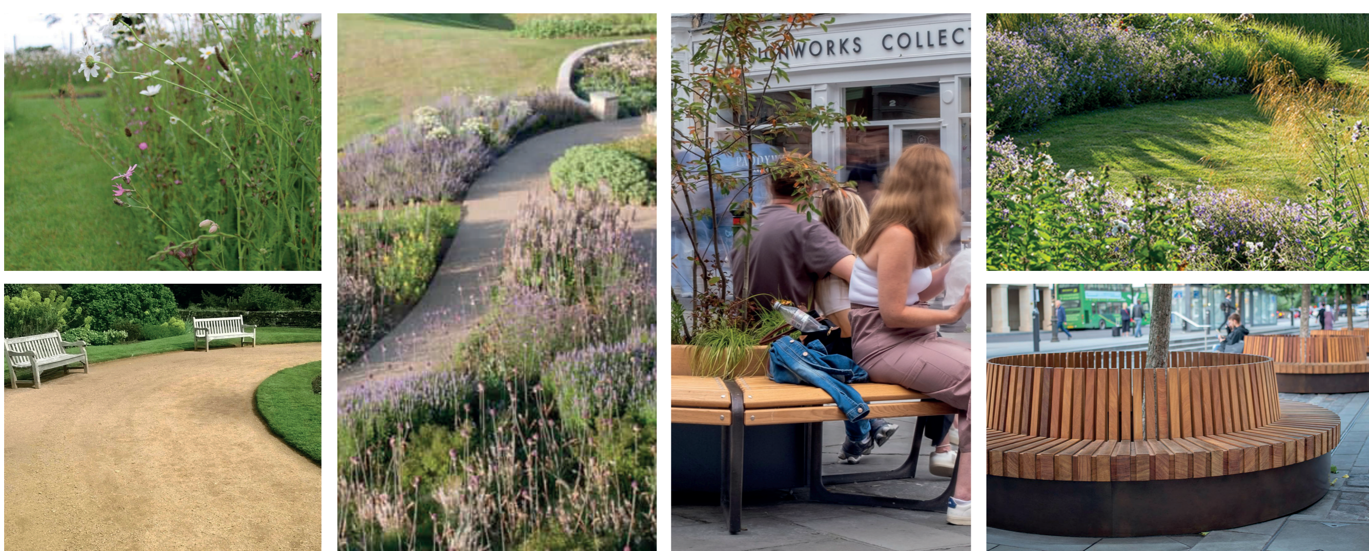
What it could look and feel like...