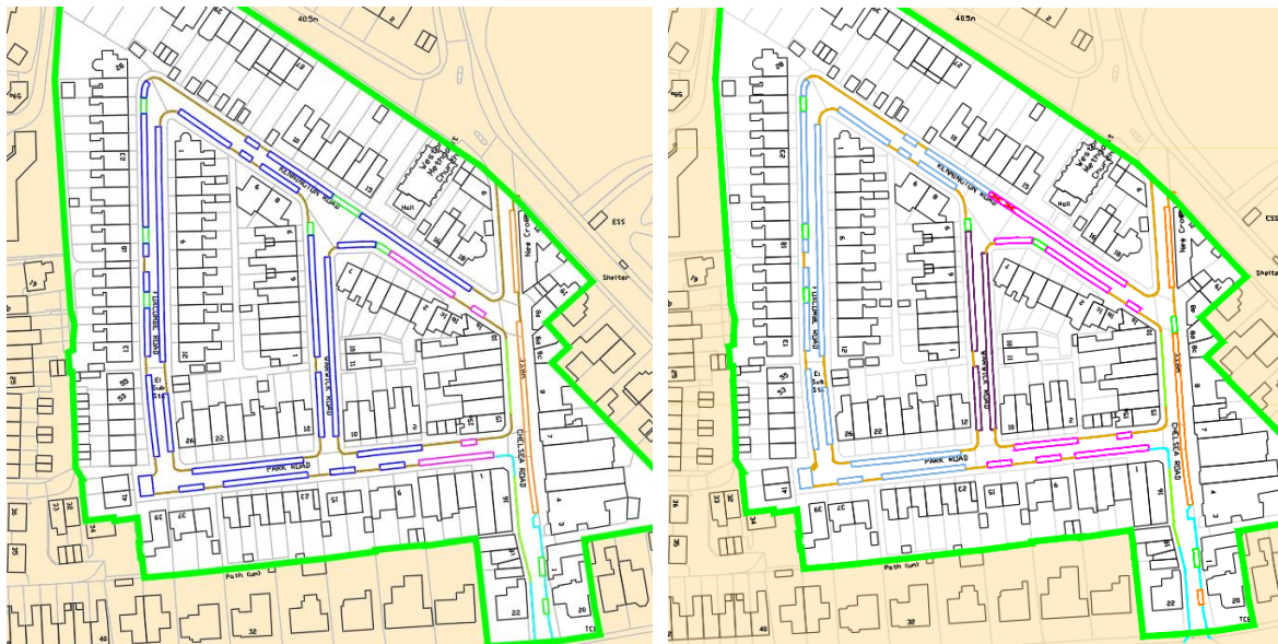
Figure 2: Proposals at consultation and as amended in line with comments