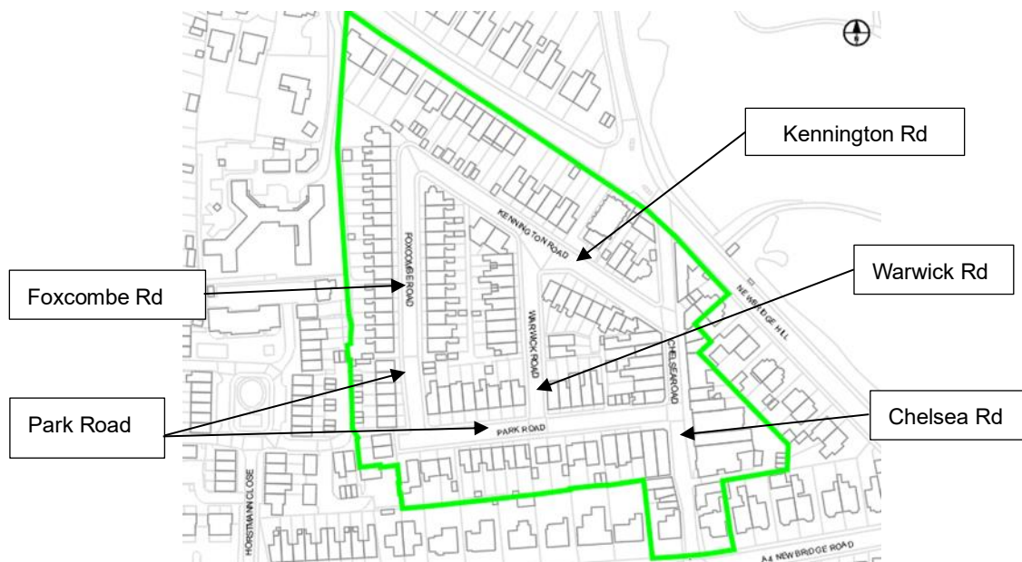
Figure 1: Zone Boundary Plan

The original study area is located west of Bath City Centre and north of the River Avon covering an area which includes Chelsea Road, Kennington Road, Warwick Road, Foxcombe Road, and Park Road. The western extent of the area is primarily a residential area with Chelsea Road being in the main part commercial properties with a mixture of retail and service businesses. The proposed RPZ boundary as presented in the initial consultation in May can be seen as a green border shown in Figure 1 below.