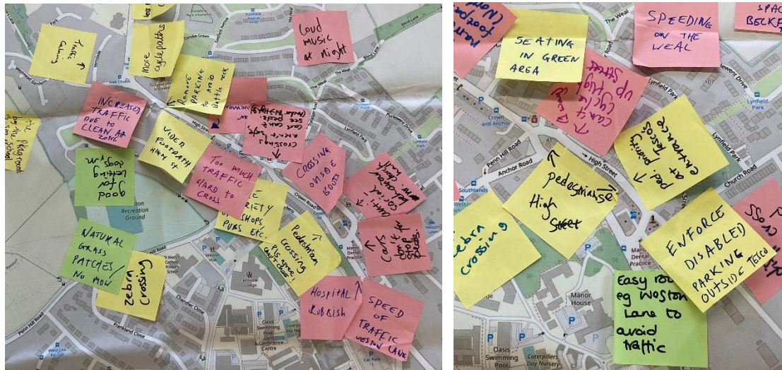
Map 3, 4. Comments on Weston High Street and surrounding roads