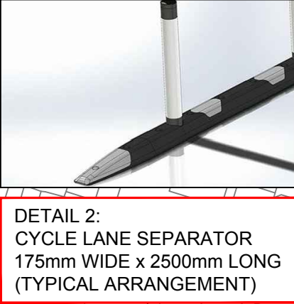
DETAIL 2: CYCLE LANE SEPARATOR 175mm WIDE x 2500mm LONG (TYPICAL ARRANGEMENT)