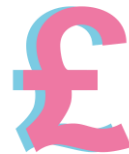
Real Living Wage