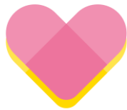
Health & Wellbeing