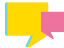
Engagement & Voice