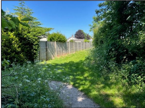
Fig. 1: From CL20/20 looking ENE

The route under investigation commences from a junction with public footpath CL20/20 at grid reference ST 5865 5936 (point A on the Investigation Plan on page 4 below) (fig.1) and proceeding in a generally east-north-easterly direction for approximately 119 metres to a junction with Church Lane at grid reference ST 5876 5940 (Point B on the Investigation Plan) (fig.4). This route is hereafter referred to as “the Application Route”.