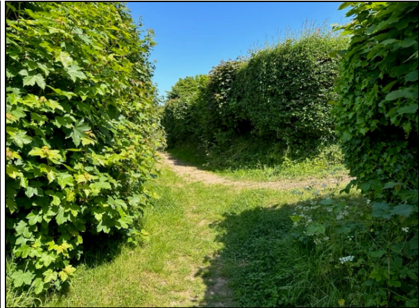
Fig. 2: 20 South of Highmead Gardens