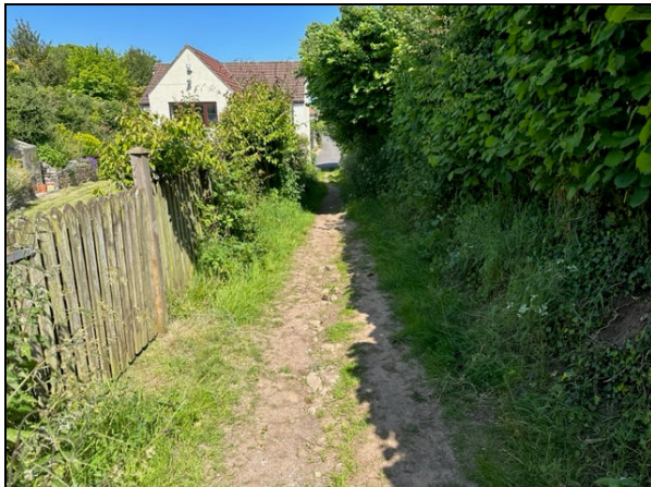
Fig. 3: South of Sutton Cottage