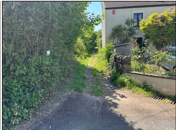
Fig. 4: From Church Lane looking WSW